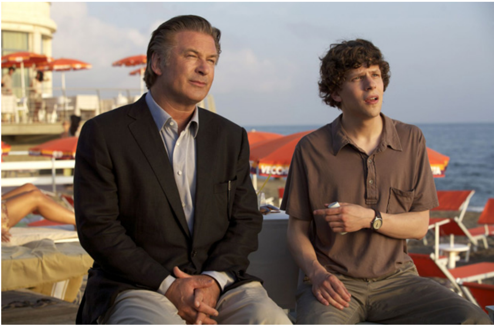
The Mentor: Alec Baldwin (John) and Jesse Eisenberg (Jack) in 'To Rome with Love'