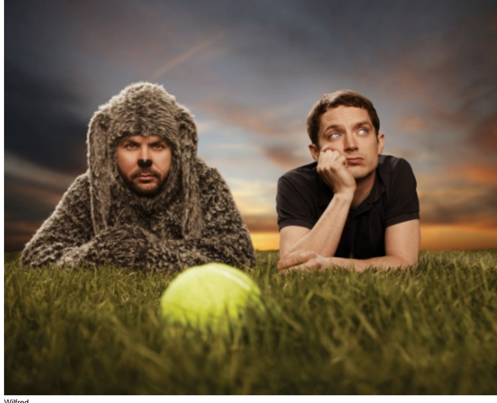
Wilfred