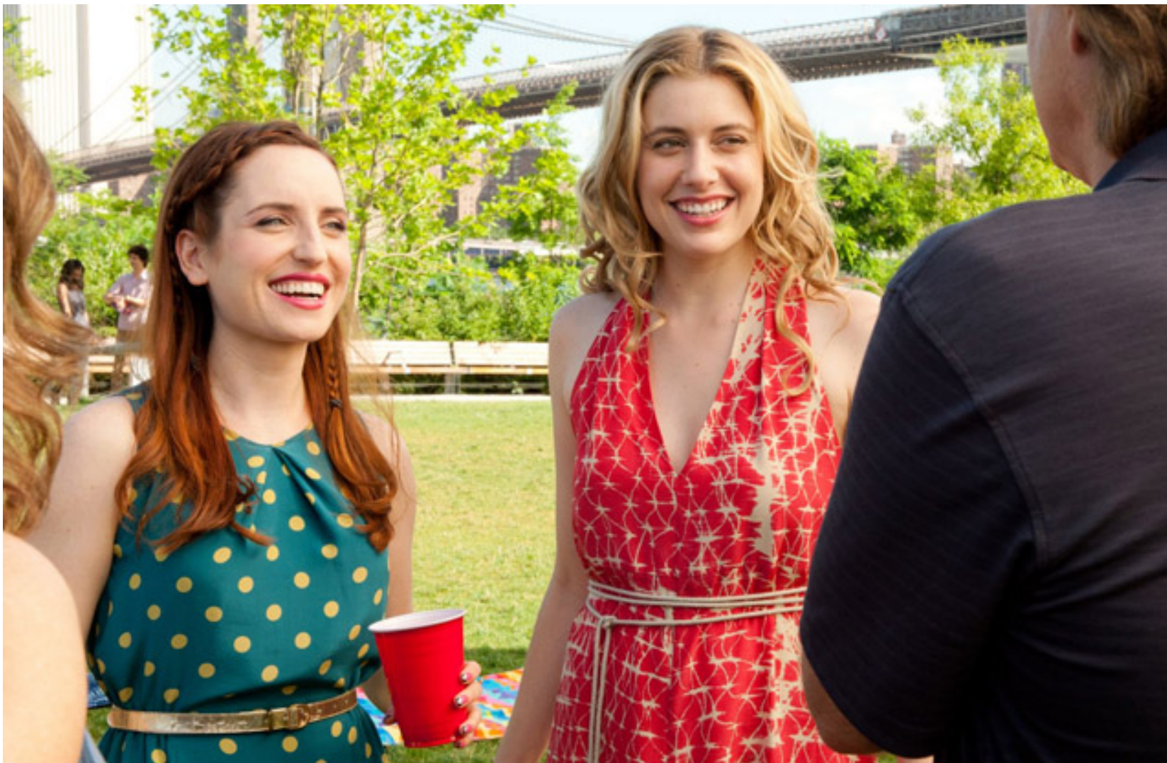
Zoe Lister Jones (Alice) and Greta Gerwig (Lola) in 'Lola Versus'