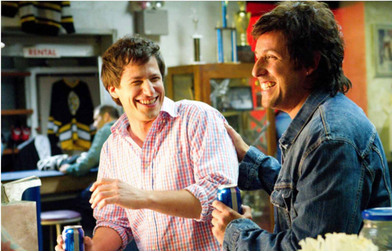
Andy Samberg (Todd/Han) Shares a Guffaw with Adam Sandler (Donny) 'That's My Boy'