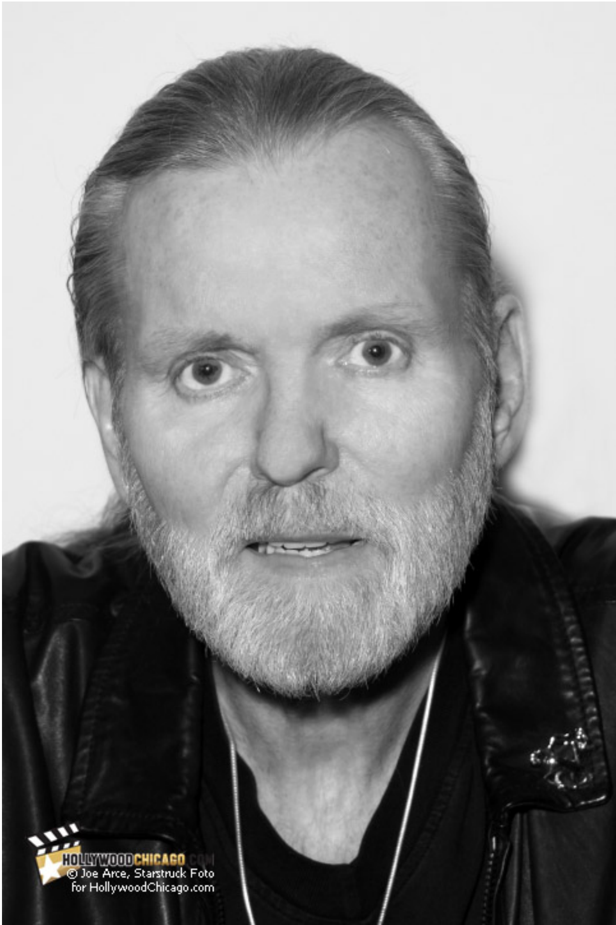
Gregg Allman at Buddy Guy's Legends, Chicago, May 12th, 2012

"My Cross to Bear" by Gregg Allman is available wherever books are sold.