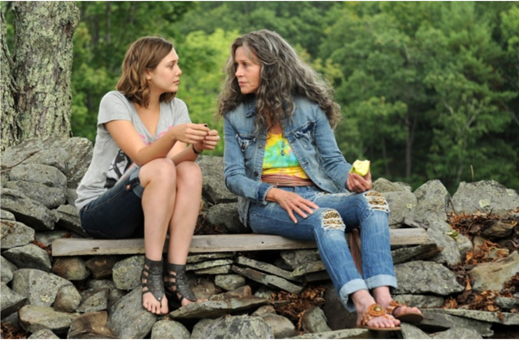
Elizabeth Olsen (Zoe) and Jane Fonda (Grace) in 'Peace, Love &amp; Misunderstanding'