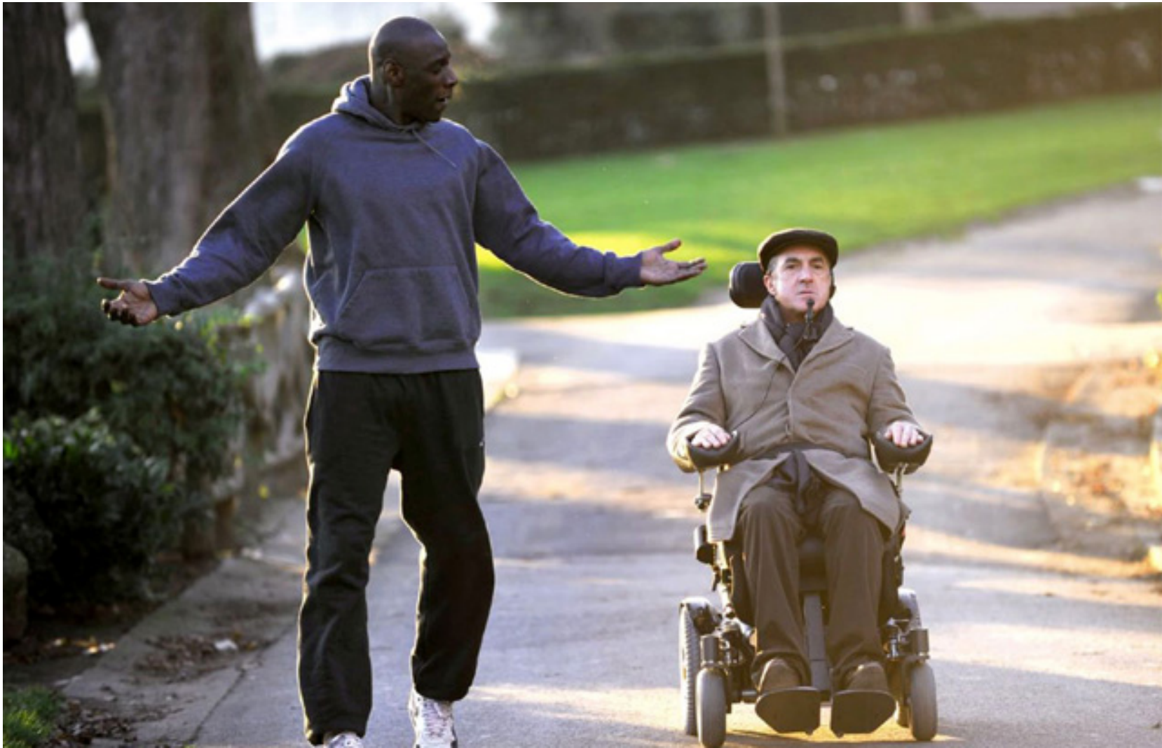
Francois Cluzet (Philippe) and Omay Sy (Driss) in ‘The Intouchables’