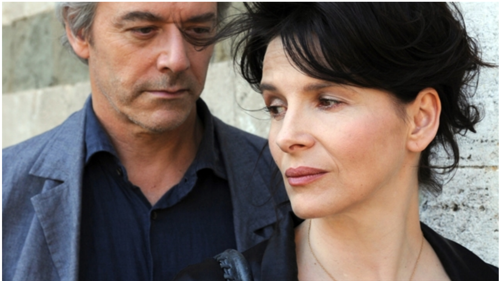
Certified Copy was released on Criterion Blu-ray and DVD on May 22, 2012