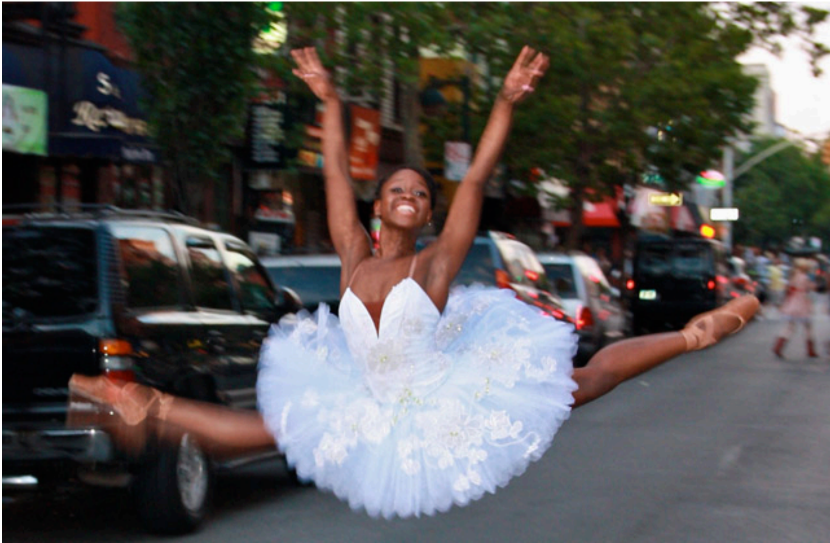
The Remarkable Micheala DePrince of ‘First Position’