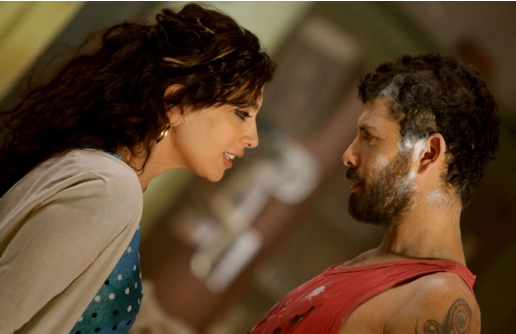
Director and Actor: Nadine Labaki (Amale) and Julien Farhat (Rabih) in ‘Where Do We Go Now?’