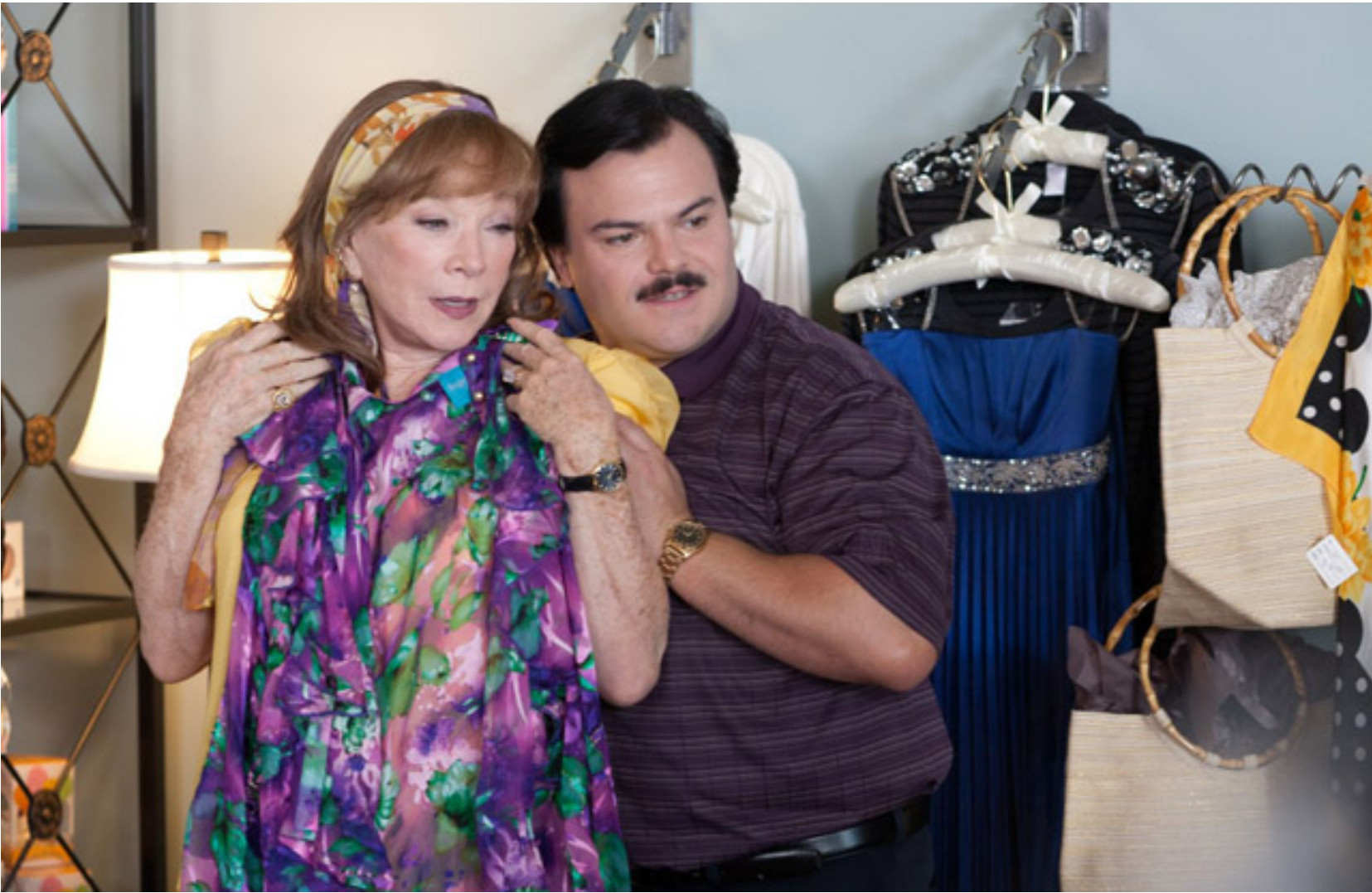
Shirley MacLaine (Marjorie) and Jack Black as the Title Character in 'Bernie'