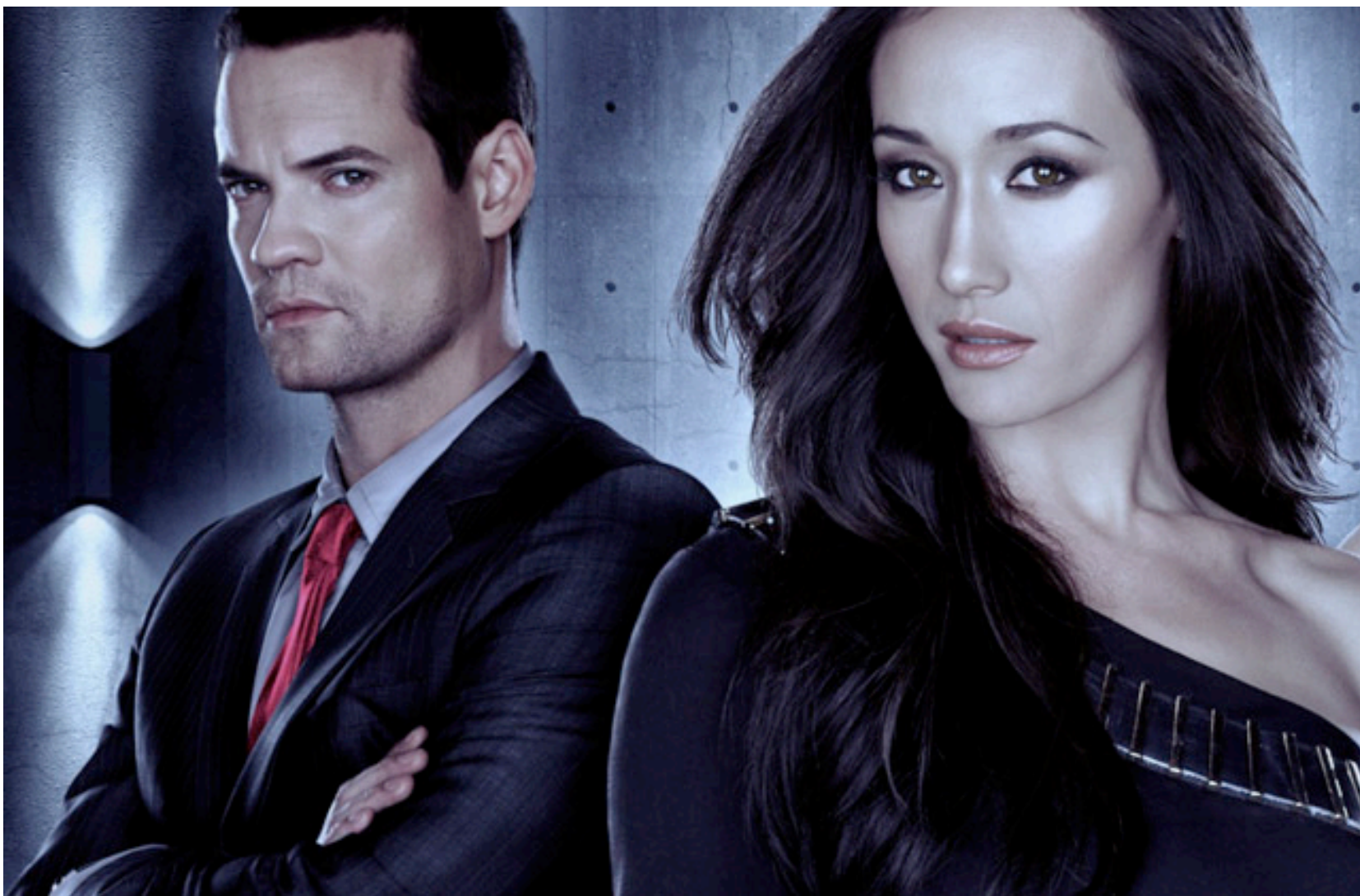
Shane West and Maggie Q of 'Nikita'