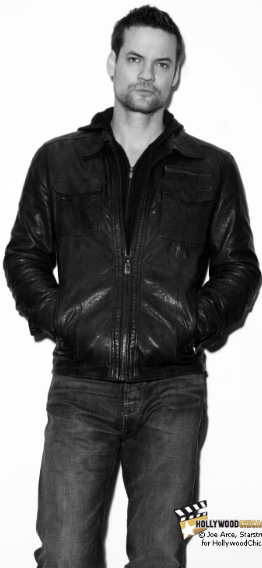
Actor Shane West at C2E2 in Chicago, April 2012