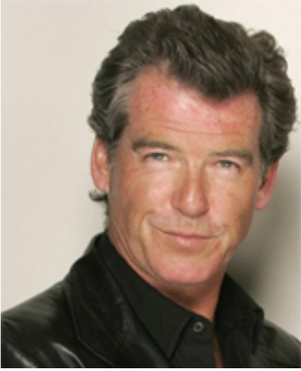
Pierce Brosnan: May 1, 2005

Whether he's Remington Steele or 007, Pierce Brosnan seems to make aging gracefully his hobby. Any film you choose with Pierce he'll be dapper, but if you want to see a Brosnan you've not seen in a while, check out Richard Shepard's "The Matador".