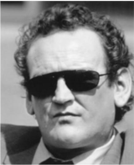
Colm Meaney: Jan. 28, 2002

Once he stepped into those testosterone-filled boots in the hit series “The Tudors,” though, he has been winning hearts across the globe. I prefer “Velvet Goldmine” because it’s a daring and flawless performance. It seems like everyone has an indie nugget in their closet.