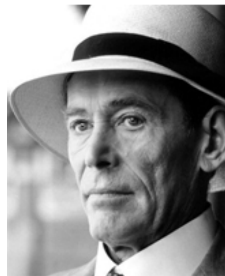
Peter O'Toole: Feb. 11, 2002

Last but certainly not least we have Peter O'Toole . I hate that I left out important peeps like Ciaran Hinds , Stephen Rea and Gabriel Byrne who truly walk on water, but for the love of Pete: it’s freaking O'Toole!