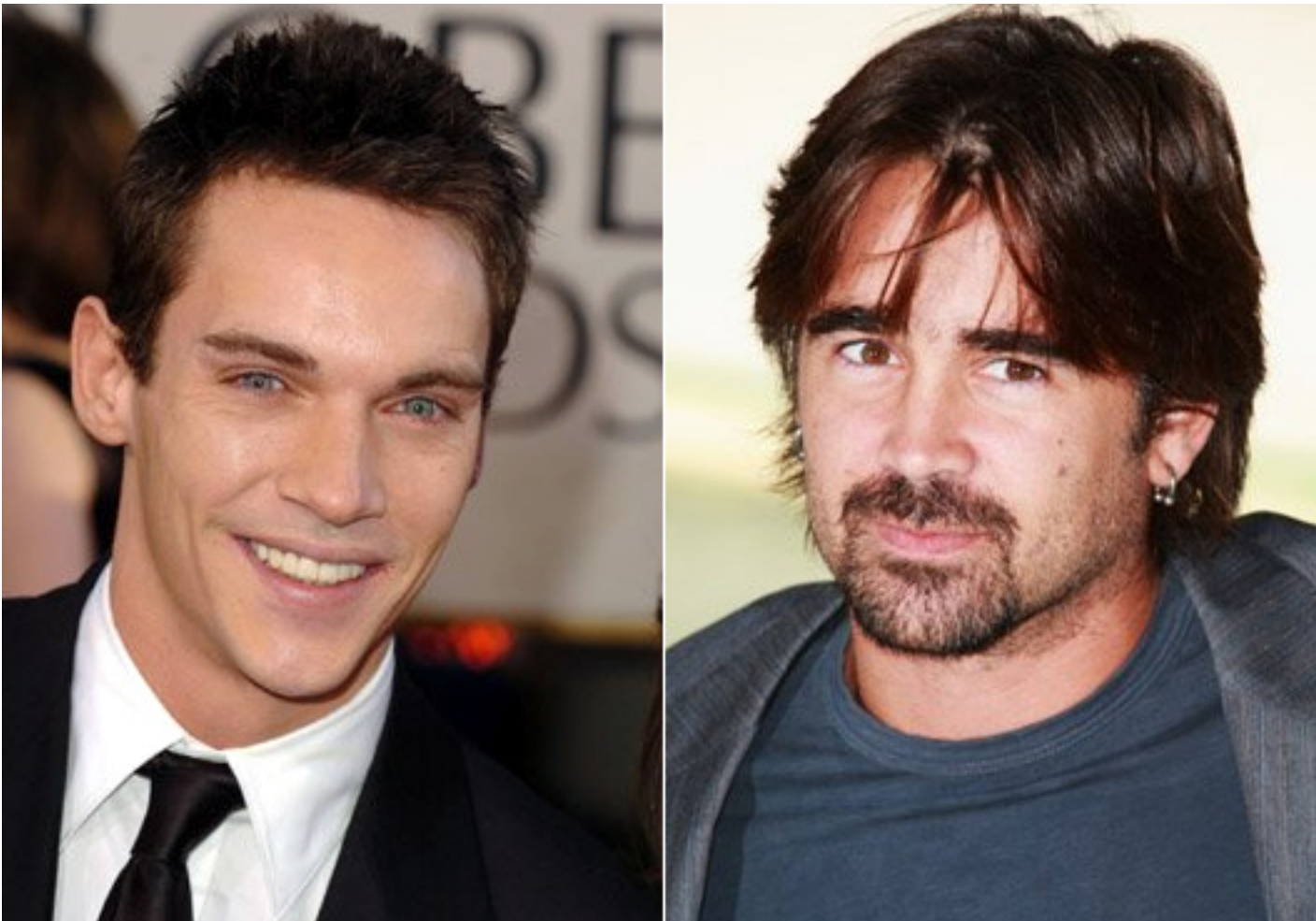
On left: Jonathan Rhys Meyers on Jan. 16, 2006; On right: Colin Farrell on Sept. 2, 2007

Bad boys Colin Farrell and Jonathan Rhys Meyers share the No. 3 spot for no other reason except there are too many seasoned thespians who can't possibly be left out. While Colin does the mainstream thing deliciously, don't miss "The New World" directed by Terence Malick where you see a much calmer and established actor.