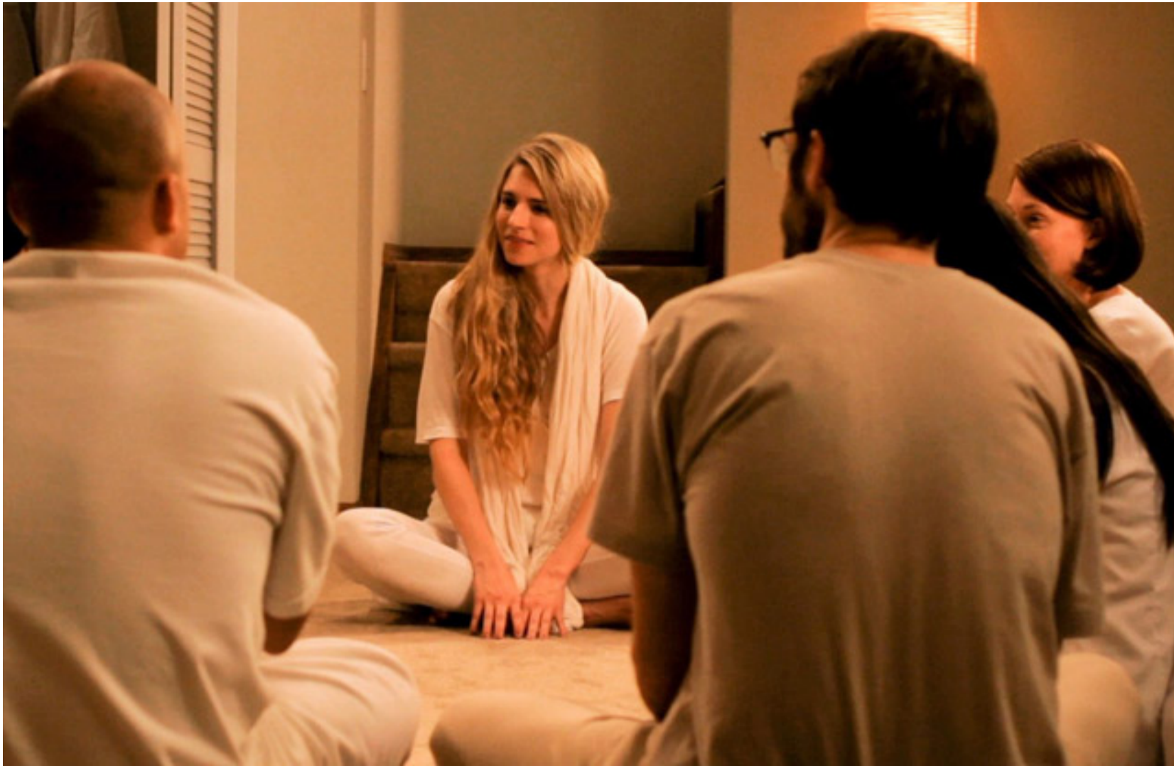
Brit Marling (Maggie) Advises the Faithful in ‘Sound of My Voice’