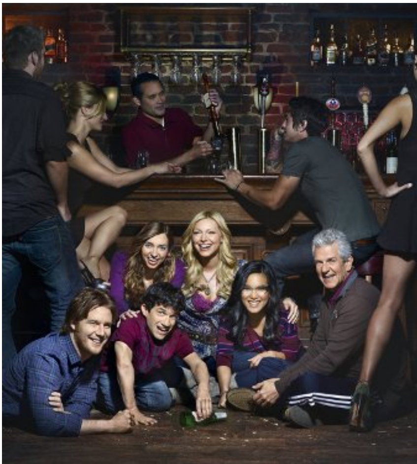
Are You There, Chelsea

We should start with what we know for sure. “Smash” and “Grimm” have been renewed. “Chuck” is over. “The Firm,” “Free Agents,” “The Playboy Club,” and “Prime Suspect” will never return.