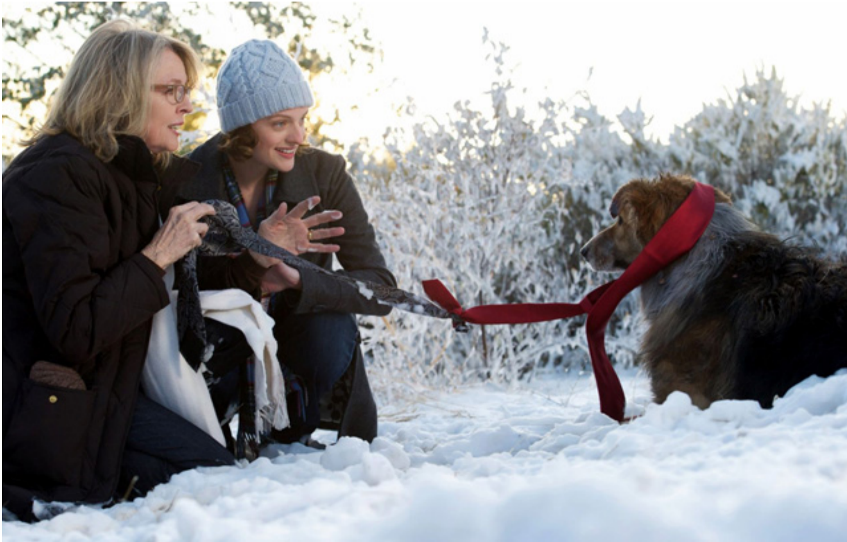
Diane Keaton (Beth) and Elizabeth Moss do a Freeway Rescue in 'Darling Companion'