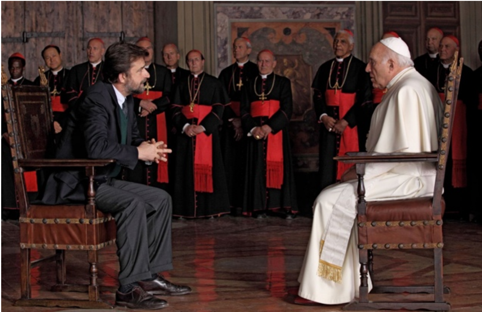
Director Nanni Moretti (the Psychiatrist) Opposite Michel Piccoli (the Pope-Elect) in 'We Have a Pope'