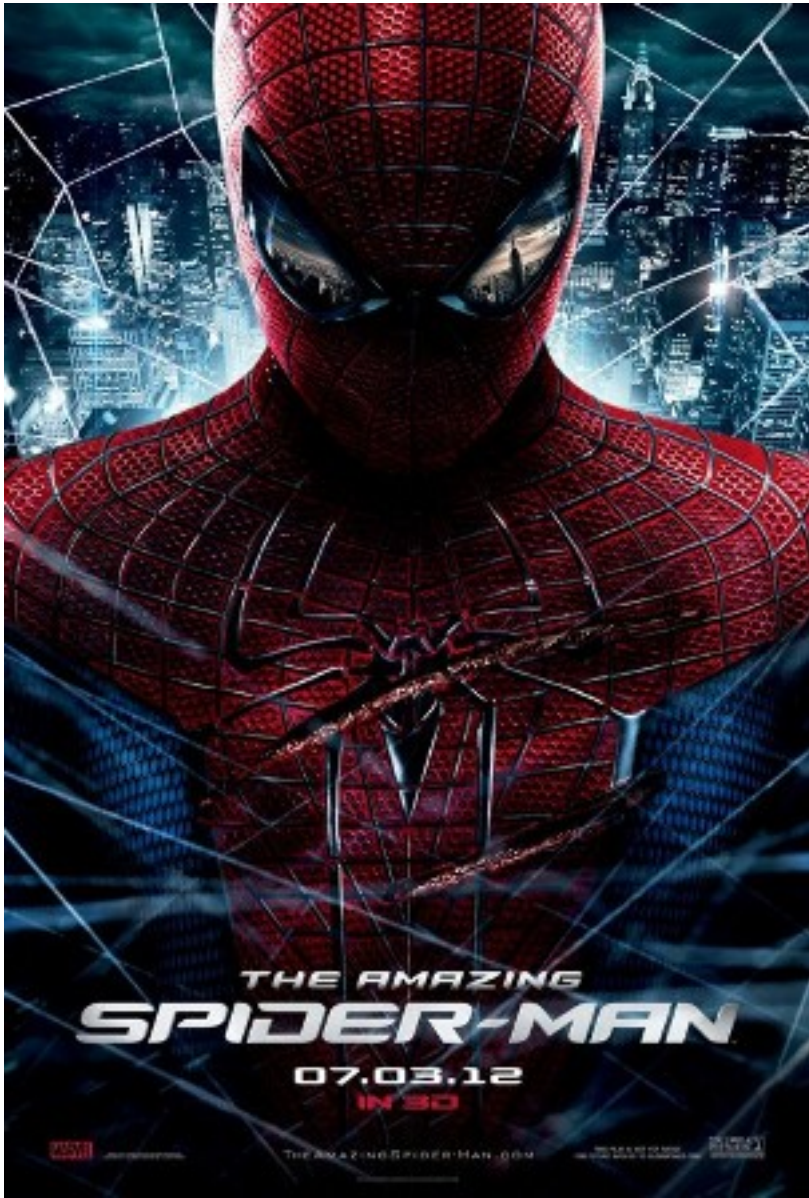
The Amazing Spider-Man