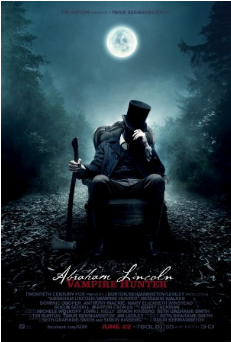
Abraham Lincoln: Vampire Hunter