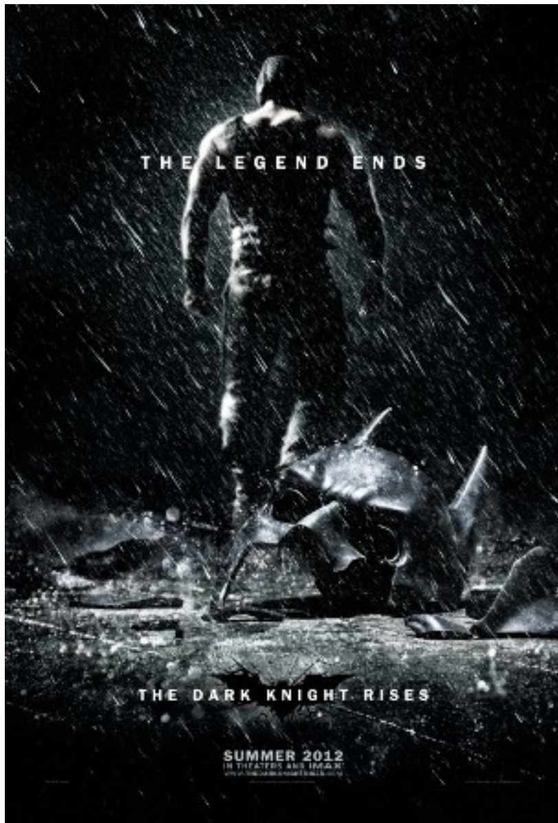
The Dark Knight Rises