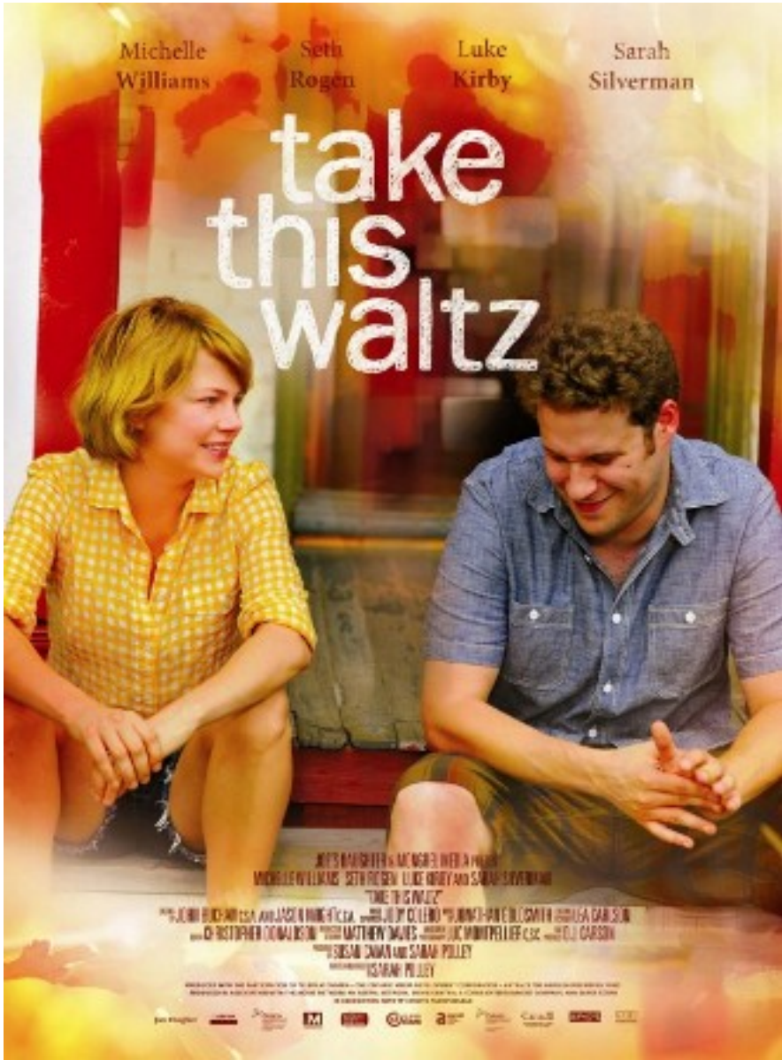
Take This Waltz