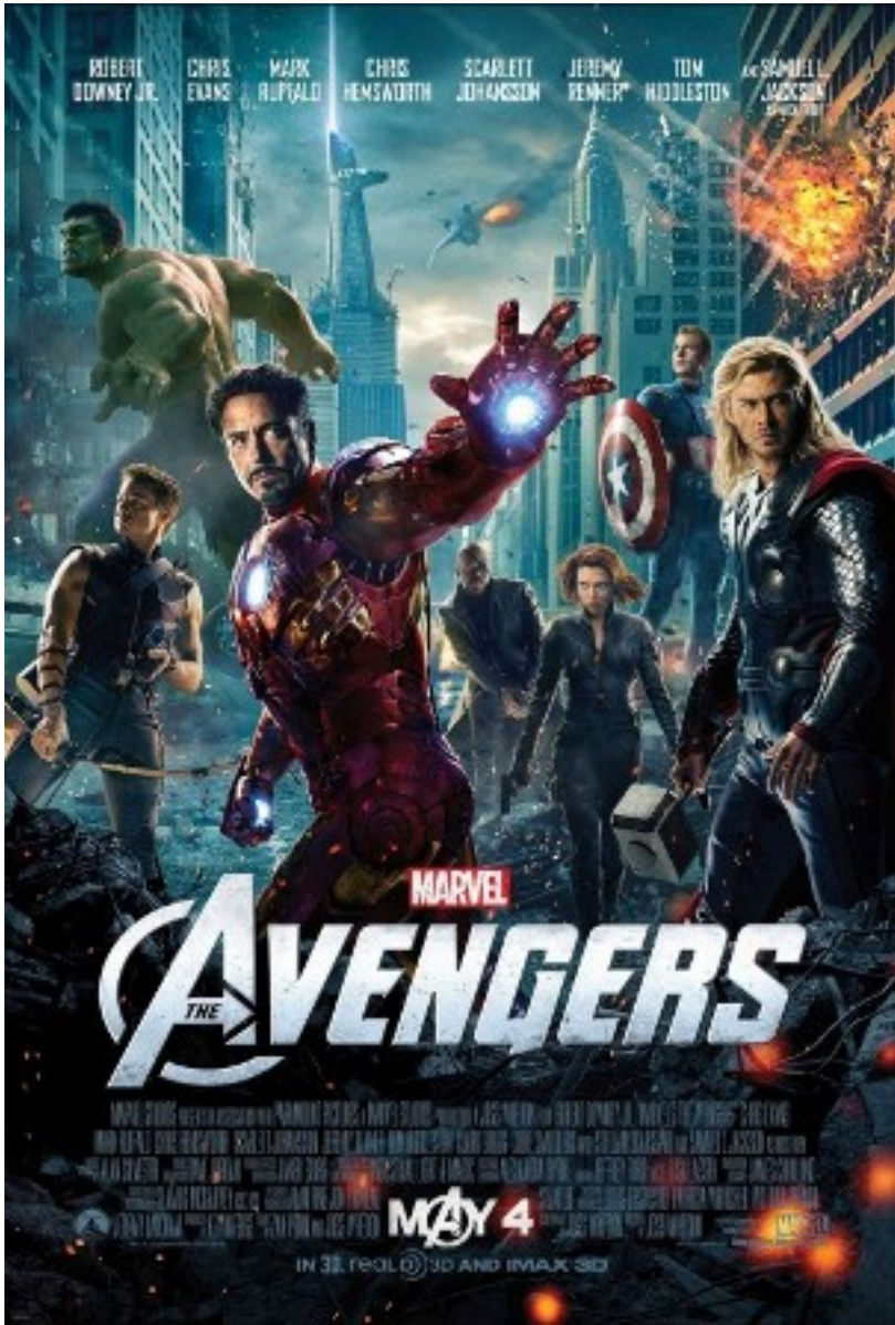
The Avengers