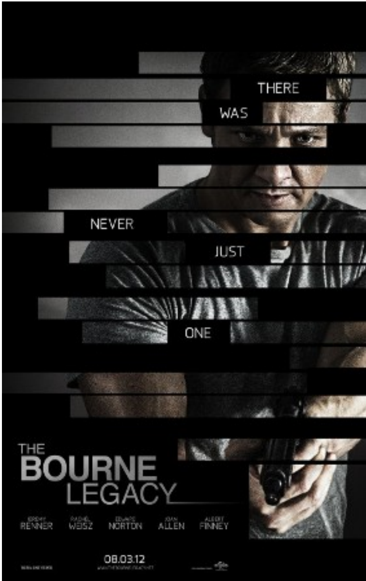
The Bourne Legacy