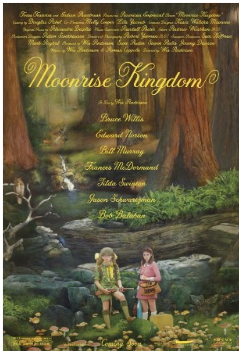
Moonrise Kingdom