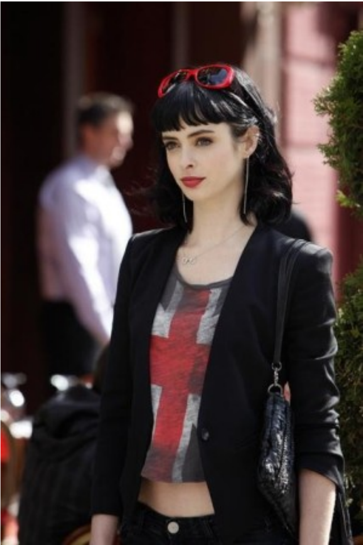
Don't Trust the B—— in Apartment 23