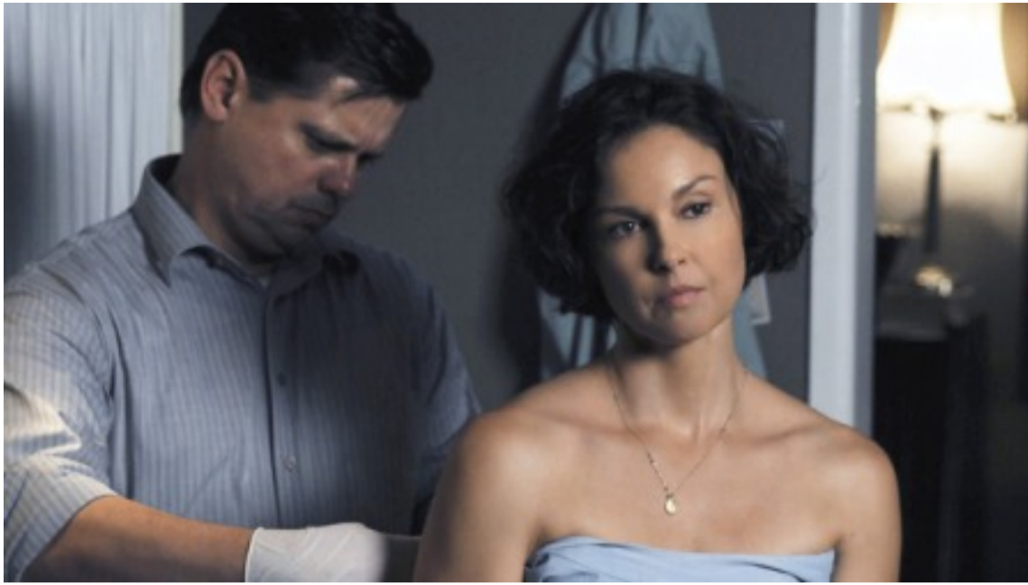
Missing

Before you know it, someone is trying to kill Becca and another C.I.A. operative (Cliff Curtis) is working to keep her in control. Becca reunites with an old flame named Giancarlo (Adriano Giannini), an Interpol agent, who offers to help and our supporting cast is in place. But don't mistake this for anything but a star vehicle for Judd. Curtis has a few decent scenes but this is Judd's show all the way. She's in nearly every scene.