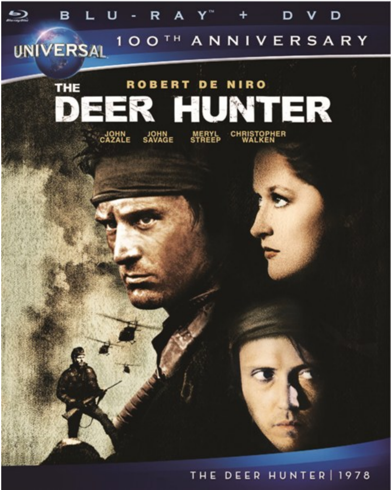
The Deer Hunter was released on Blu-ray and DVD on March 6, 2012

As for why Universal chose to send DVD copies of the other titles, it's hard to say. You definitely want to pick up the Criterion "Charade" Blu-ray over this standard edition. As for "Godfrey" and "Sullivan's," they're releases for hardcore film nuts only. Most people interested in them probably already have them on DVD, making Collector's Series releases a bit odd. However, it's only about ten weeks into 2012 and the Universal 100th Anniversary Collector's Series has lived up to its potential as one of the most important Blu-ray and DVD release series of the year. It truly is "100 Years of Unforgettable Movies." Remember these ones.