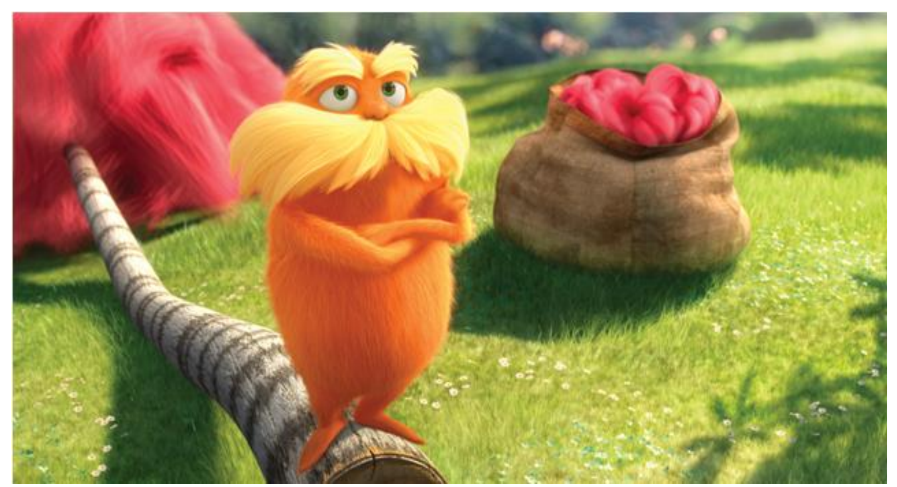
Dr. Seuss' The Lorax

Published on HollywoodChicago.com (http://www.hollywoodchicago.com)