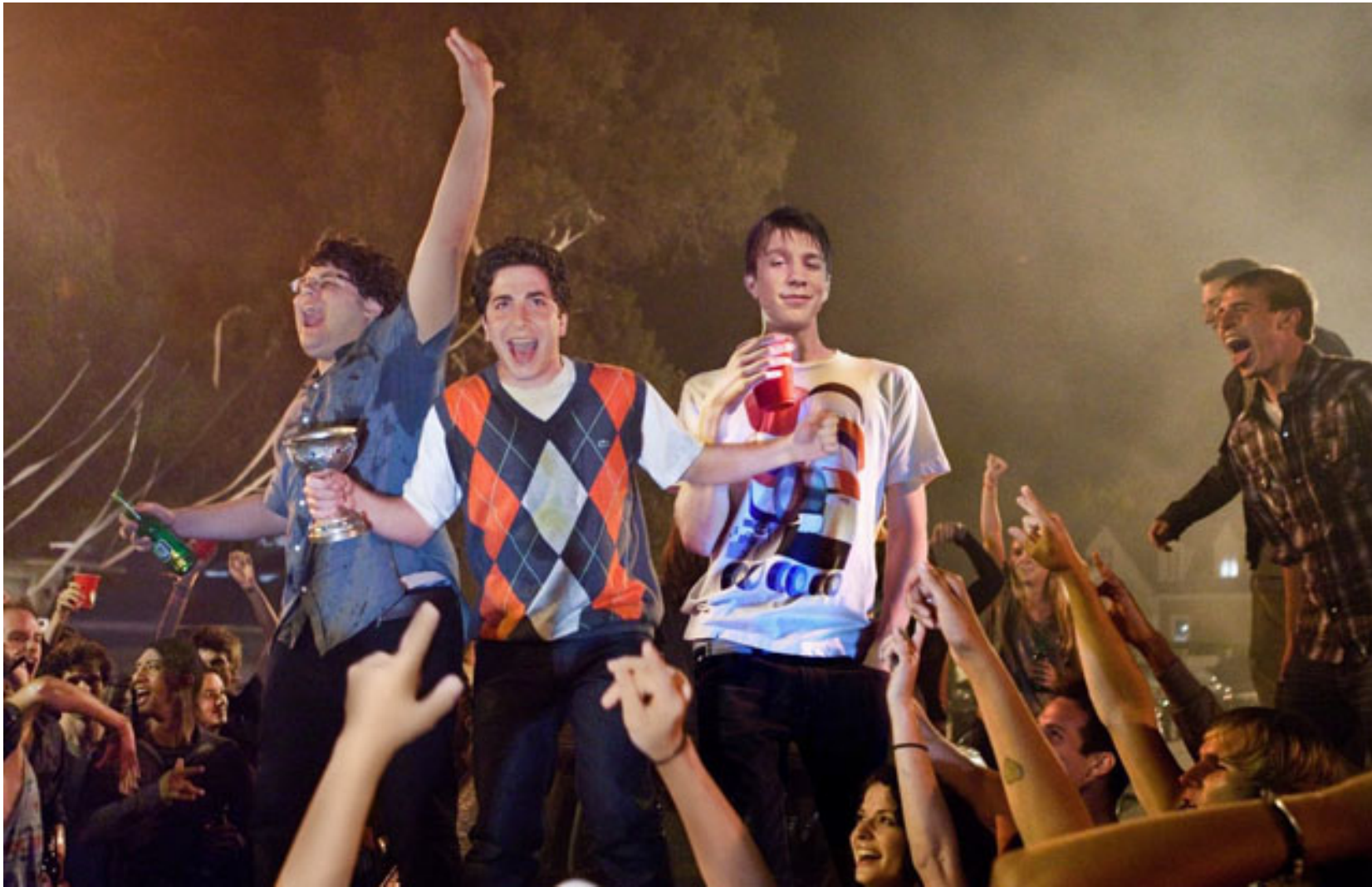
L-R: Jonathan Daniel Brown (J.B.), Oliver Cooper (Costa) and Thomas Mann (Thomas) in ‘Project X’