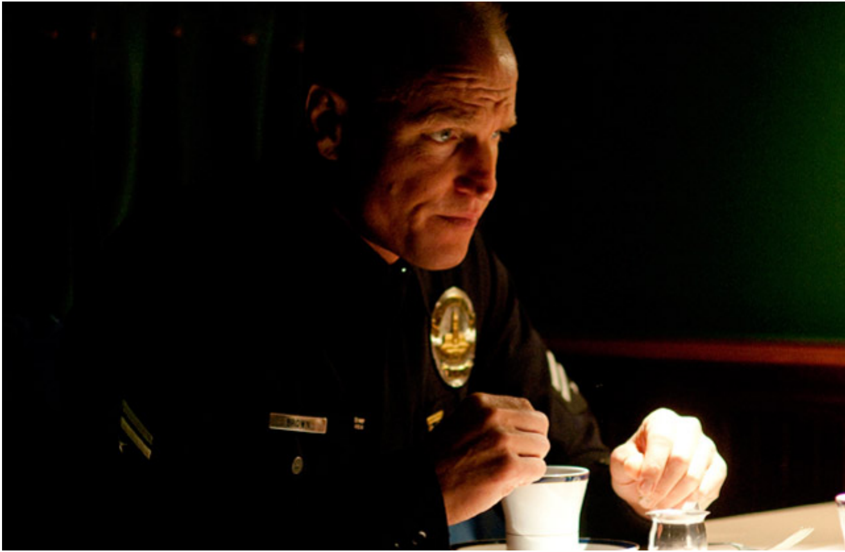
To Serve and Protect: Woody Harrelson (Officer David Brown) in ‘Rampart’