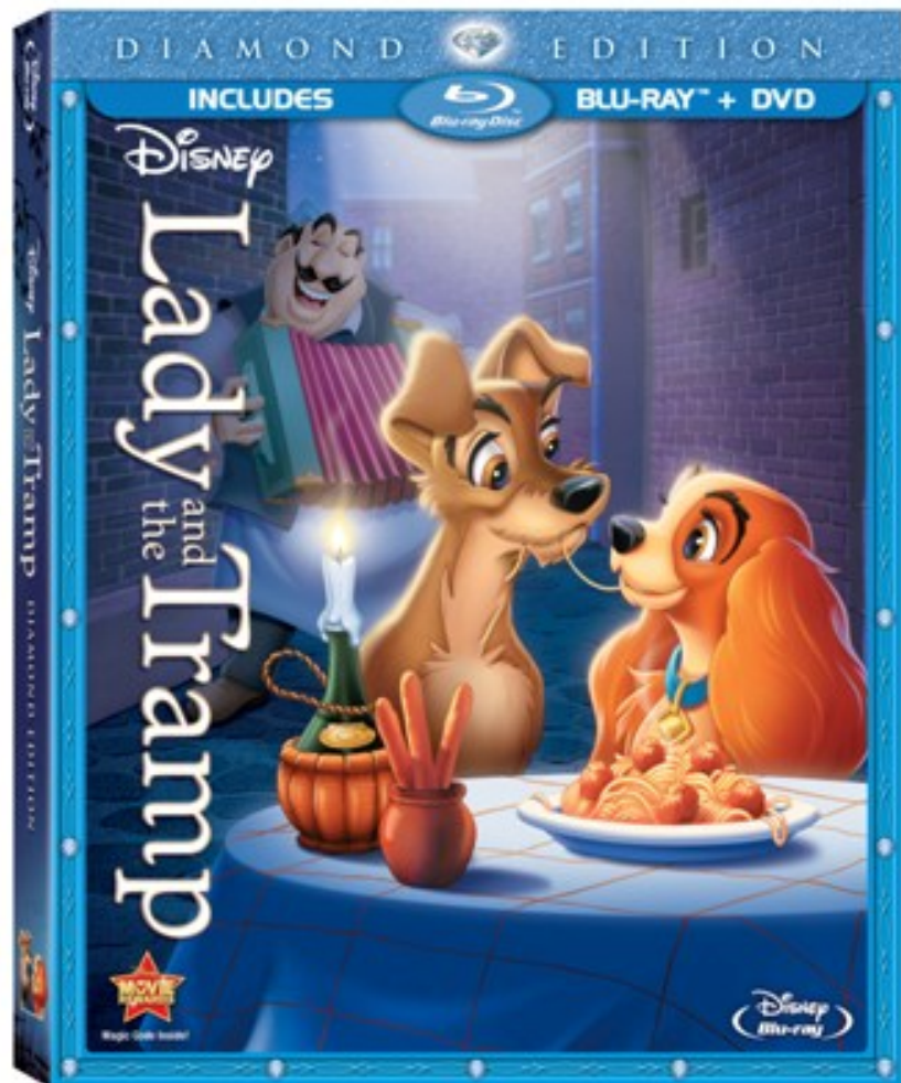
Lady and the Tramp was released on Blu-ray and re-released on DVD on February 7, 2012

The draw of the Blu-ray release of "Lady and the Tramp" is the HD transfer and the second screen functionality. There aren't a great number of new special features in no small part because the features on the DVD edition (which have been transported to this one) are fantastic. The making-of documentary is great, drawing the line between Walt Disney's history, this film, and even the design of Disneyland, which opened the same year. There are two new pieces of archival footage on the "Lady" Blu-ray, including a never-before-seen deleted scene and a never-before-seen deleted song. Other new special features are scant, except for second screen. But, like I said, the imported features are strong enough that it's not an issue.