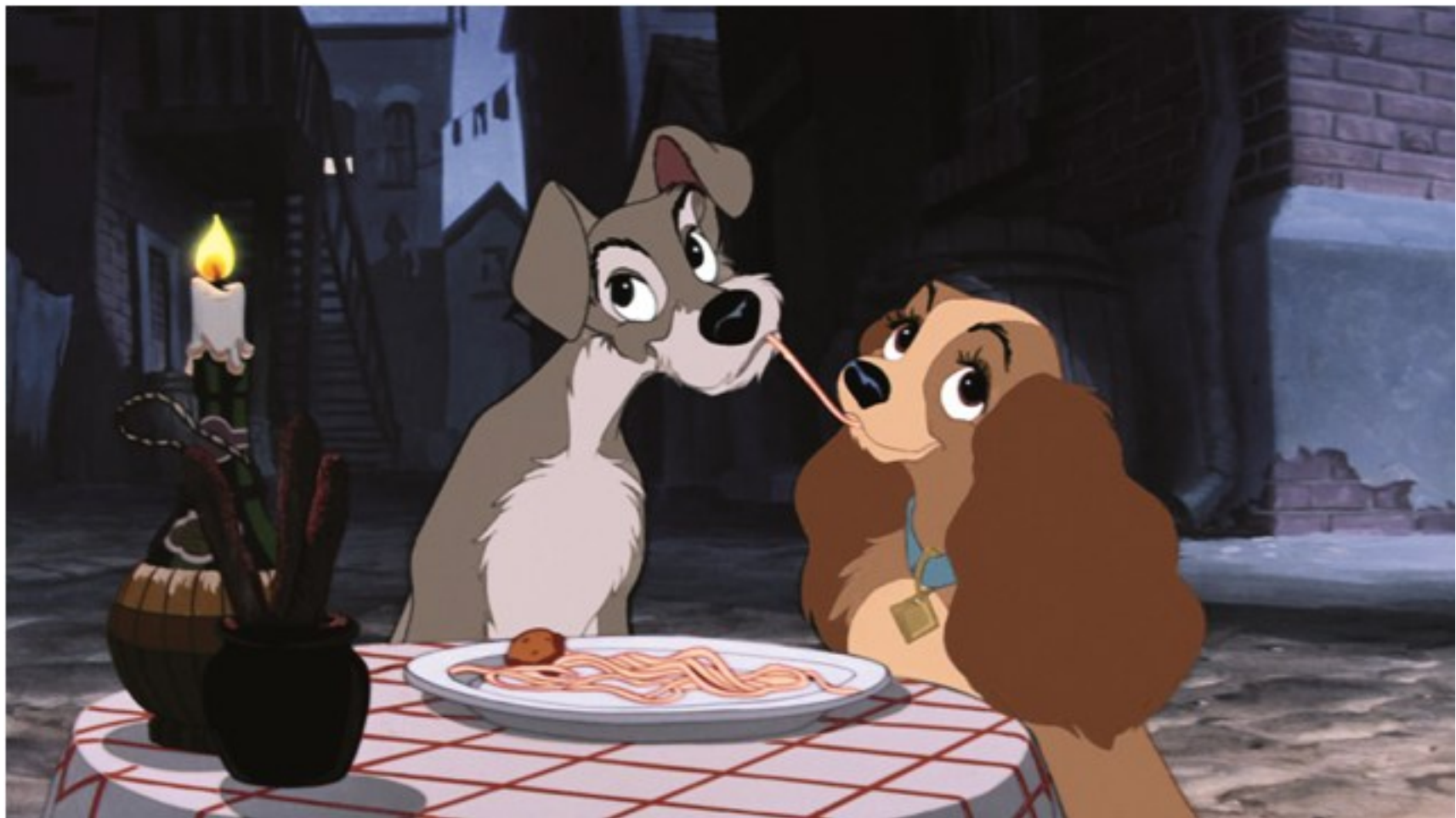
Lady and the Tramp was released on Blu-ray and re-released on DVD on February 7, 2012

Nuzzled comfortably in the canon between “Peter Pan” and “Sleeping Beauty,” 1955’s “Lady and the Tramp” is one of the gentler, sweeter films in the Disney legacy. It’s nowhere near as manic or kiddie-oriented as some of the more popular films in the company’s history and that could explain some of its lesser reputation. Although, to be fair, even Disney films with less of a profile than others have a huge cultural impact. Is there anyone who’s ever shared a plate of spaghetti without picturing Lady and the Tramp sharing an accidental kiss? And as recently as last summer, Time actually went to the extreme end of naming this film, one that was a box office smash but largely panned by critics on its release, as one of the top 25 animated films of all time.