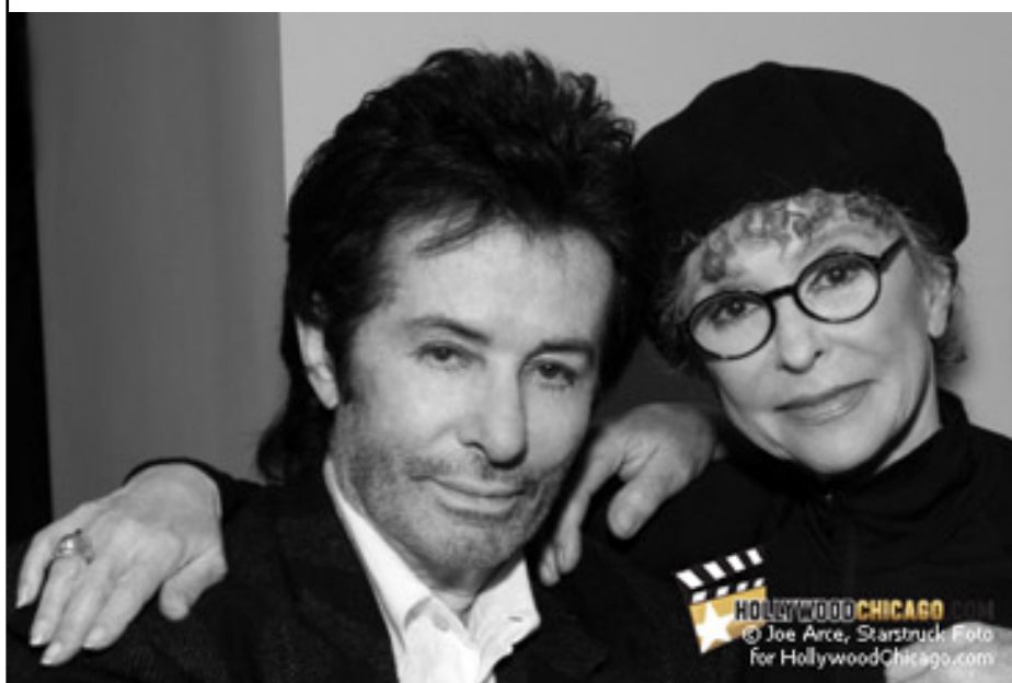
Oscar Winners: George Chakiris, Rita Moreno in Chicago, 2010

HollywoodChicago.com: You did a couple of films overseas in the 1960s. Was it because your opportunities were limited in America or was it just the opportunity for a good role?