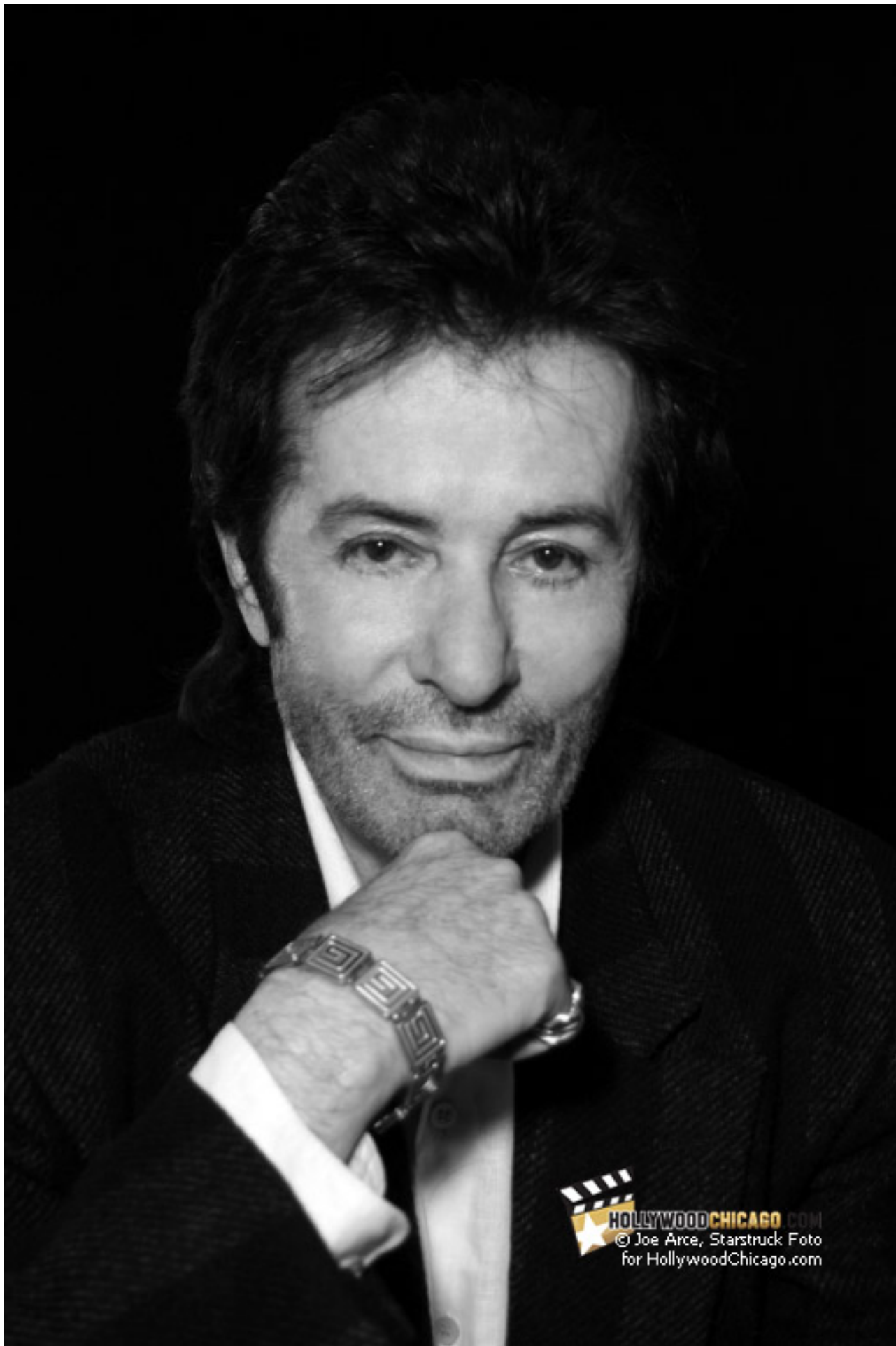
George Chakiris in Chicago, 2010