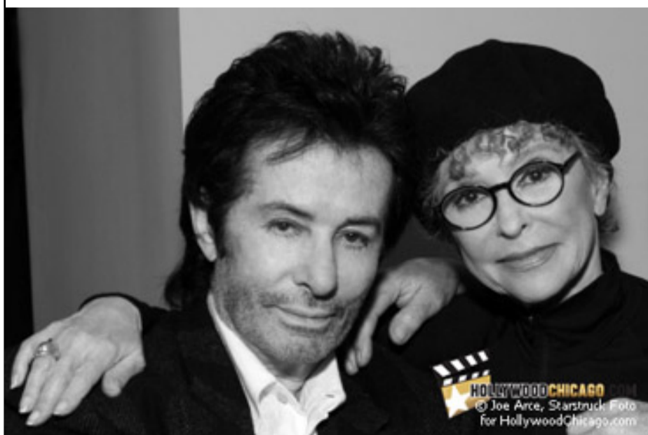
Oscar Winners: George Chakiris, Rita Moreno in Chicago, 2010

HollywoodChicago.com: You did a couple of films overseas in the 1960s. Was it because your opportunities were limited in America or was it just the opportunity for a good role?