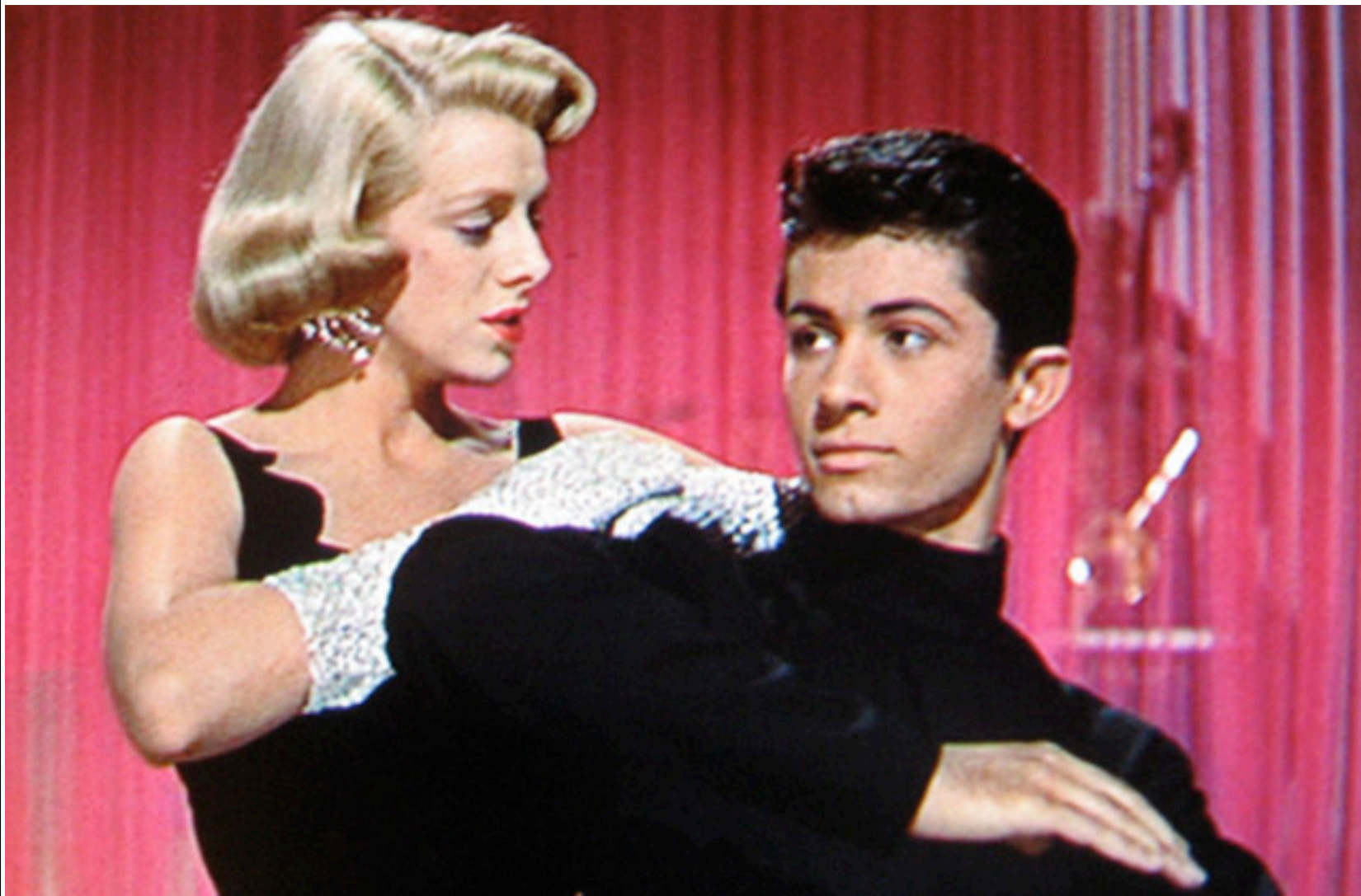
The Face That Launched a 1000 Proposals: Rosemary Clooney and George Chakiris in 'White Christmas'