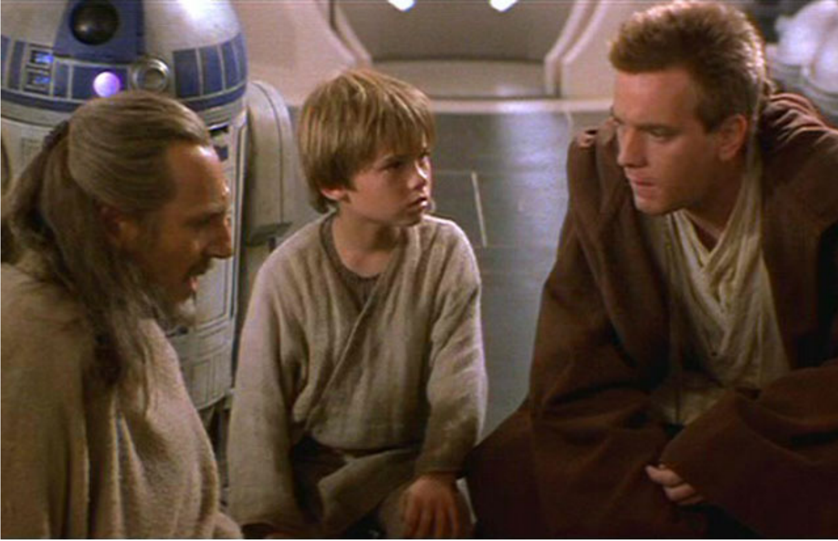
Liam Neeson, Jake Lloyd and Ewan McGregor in ‘Star Wars: Episode 1 – The Phantom Menace’

★ Continue reading for Patrick McDonald’s full review of “Star Wars: Episode 1 – The Phantom Menace” [15]