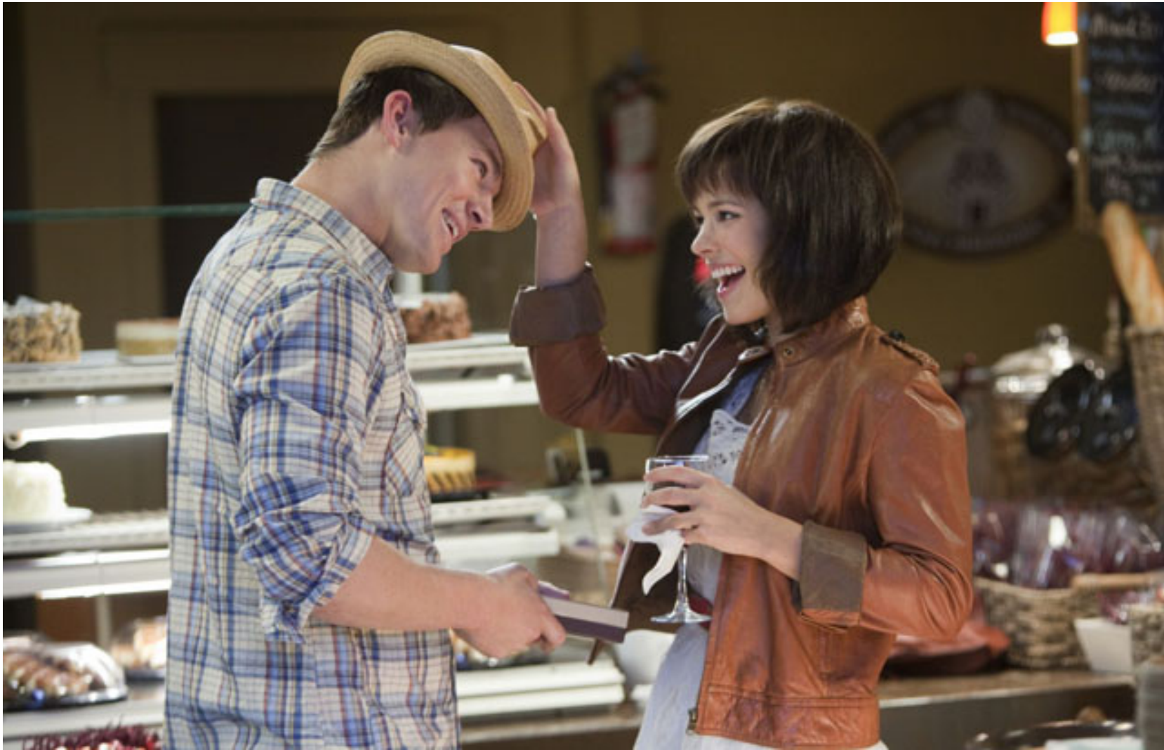
Channing Tatum (Leo) and Rachel McAdams (Paige) Meet Cute in 'The Vow'