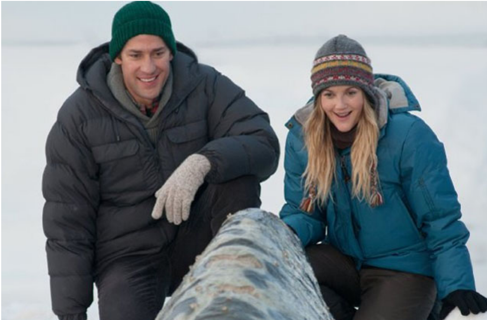
John Krasinski (Adam) and Drew Barrymore (Rachel) in ‘Big Miracle’