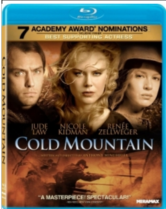
Cold Mountain