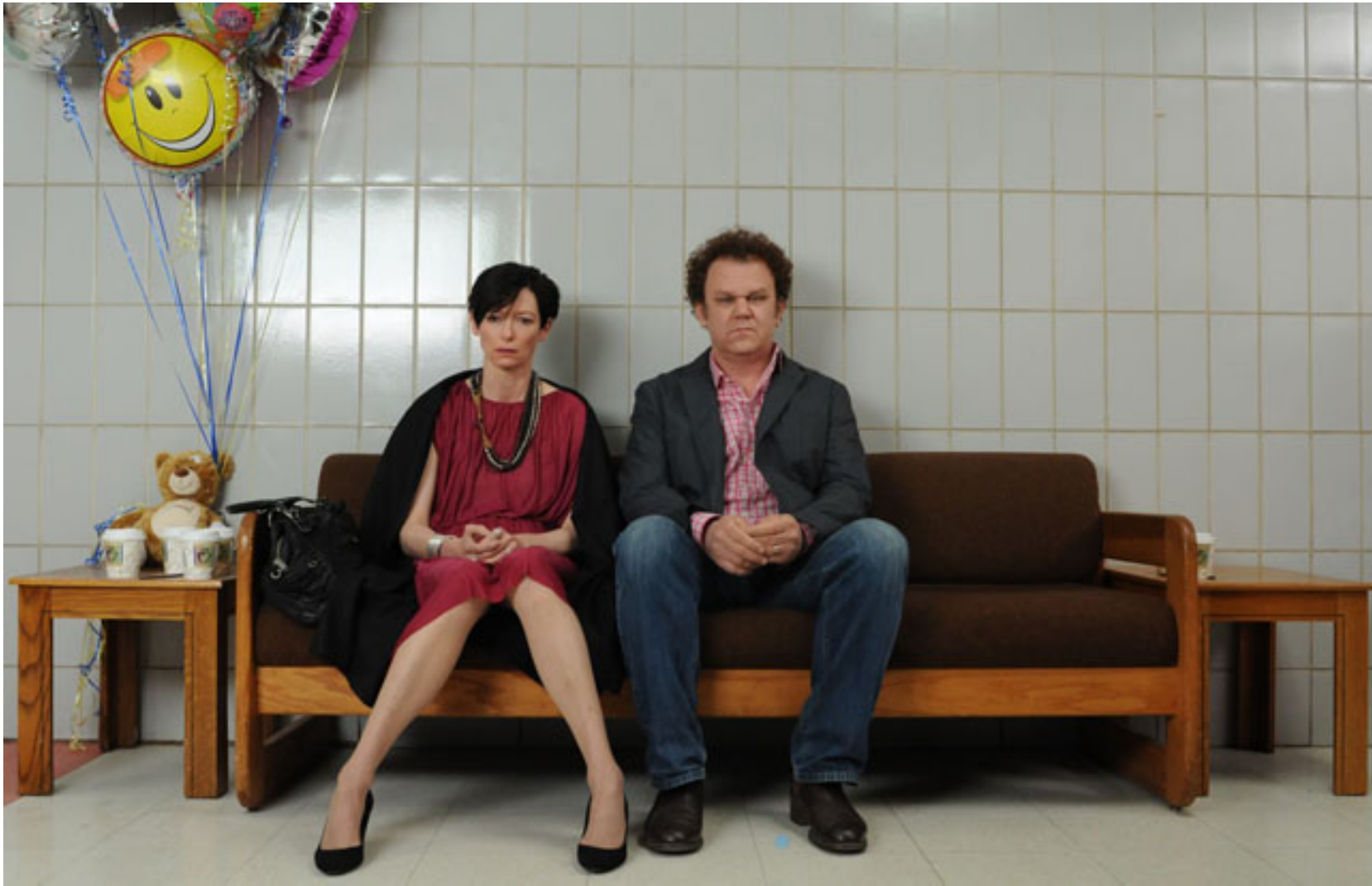
Tilda Swinton (Eva) and John C. Reilly (Franklin) in ‘We Need to Talk About Kevin’