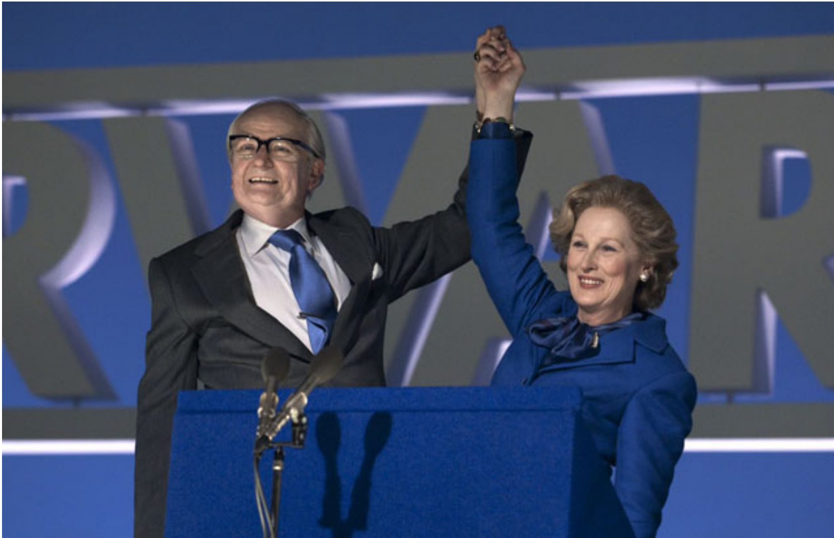
Jim Broadbent (Denis Thatcher) and Meryl Streep (Margaret Thatcher) in ‘Iron Lady’