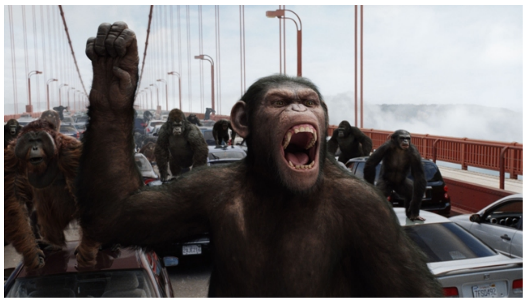
Rise of the Planet of the Apes

After Tim Burton's sterile "Planet of the Apes" in 2001, who would have guessed that we would get an entry in the same franchise that not only works creatively but, on a filmmaking level, is the best of the entire series? The 1968 original will always have the pop culture influence that makes it the sentimental favorite, but "Rise" is a better film overall. It is pure summer entertainment, expertly paced to an inevitable climax and never less than satisfying. Don't just rent it. Buy it.