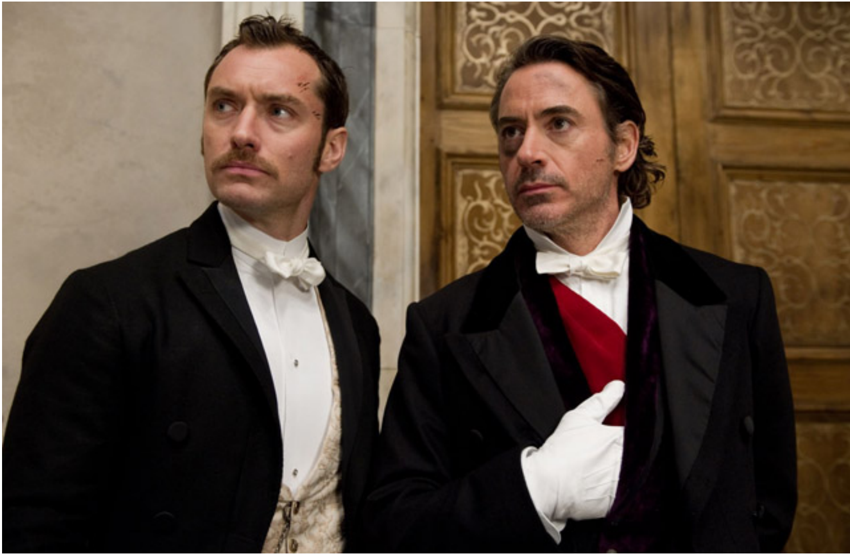
Jude Law as Dr. Watson and Robert Downey Jr. as the Title Detective in ‘Sherlock Holmes: Game of Shadows’