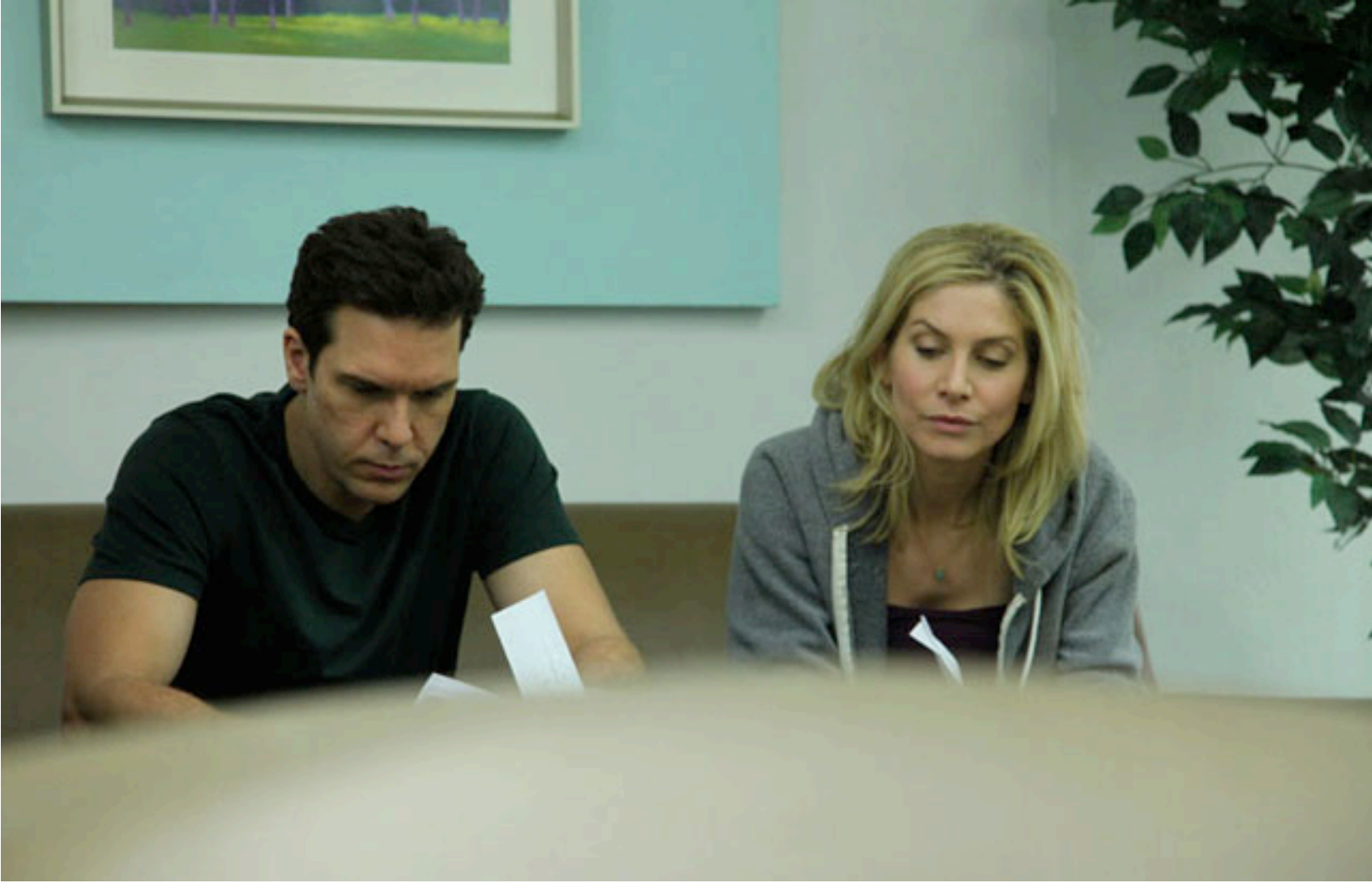
Melancholy Dane: Ryan (Dane Cook) and Kate (Elizabeth Mitchell) in ‘Answers to Nothing’