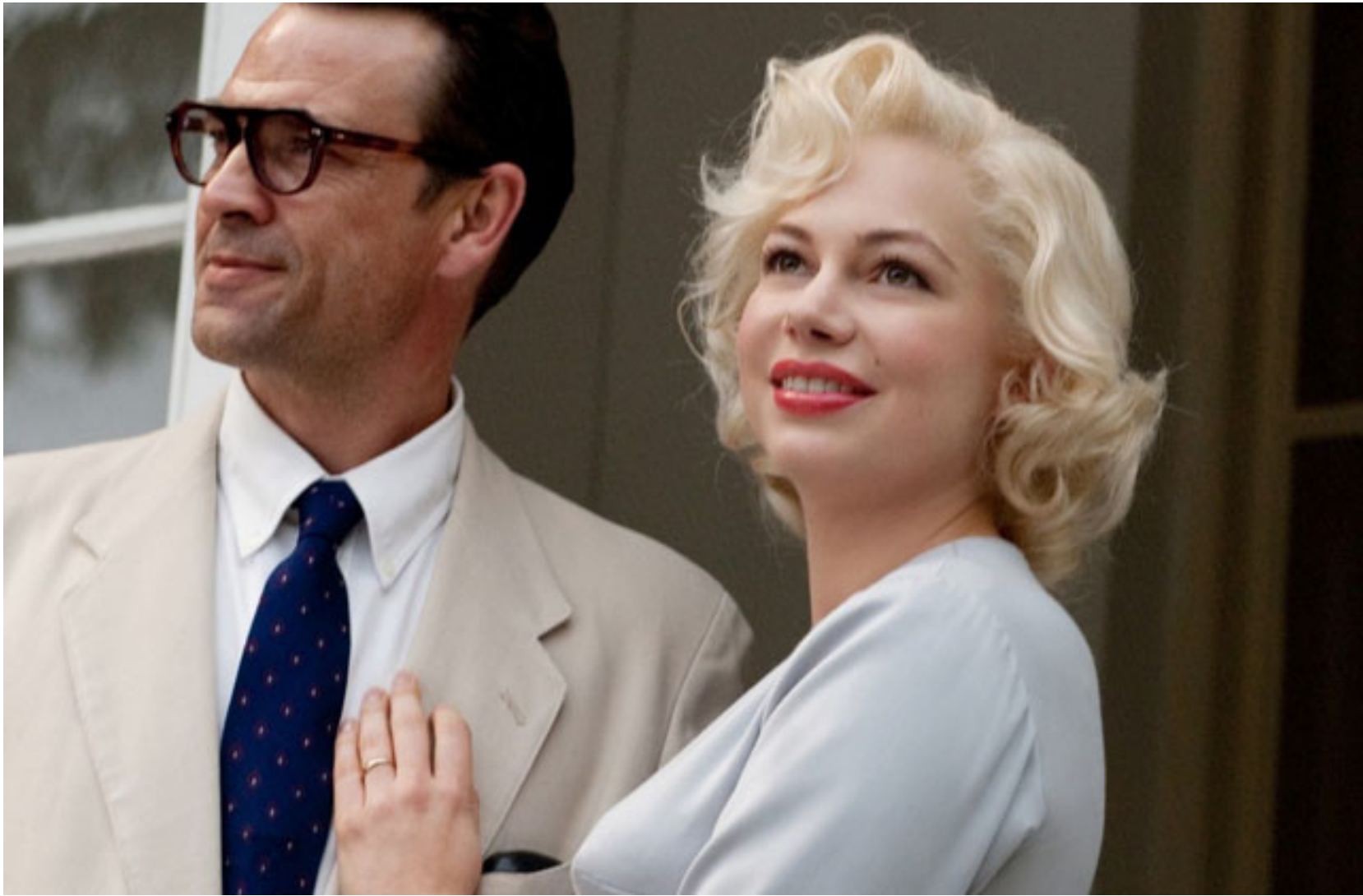
Power Couple: Dougray Scott as Arthur Miller and Michelle Williams as Marilyn Monroe in ‘My Week with Marilyn’