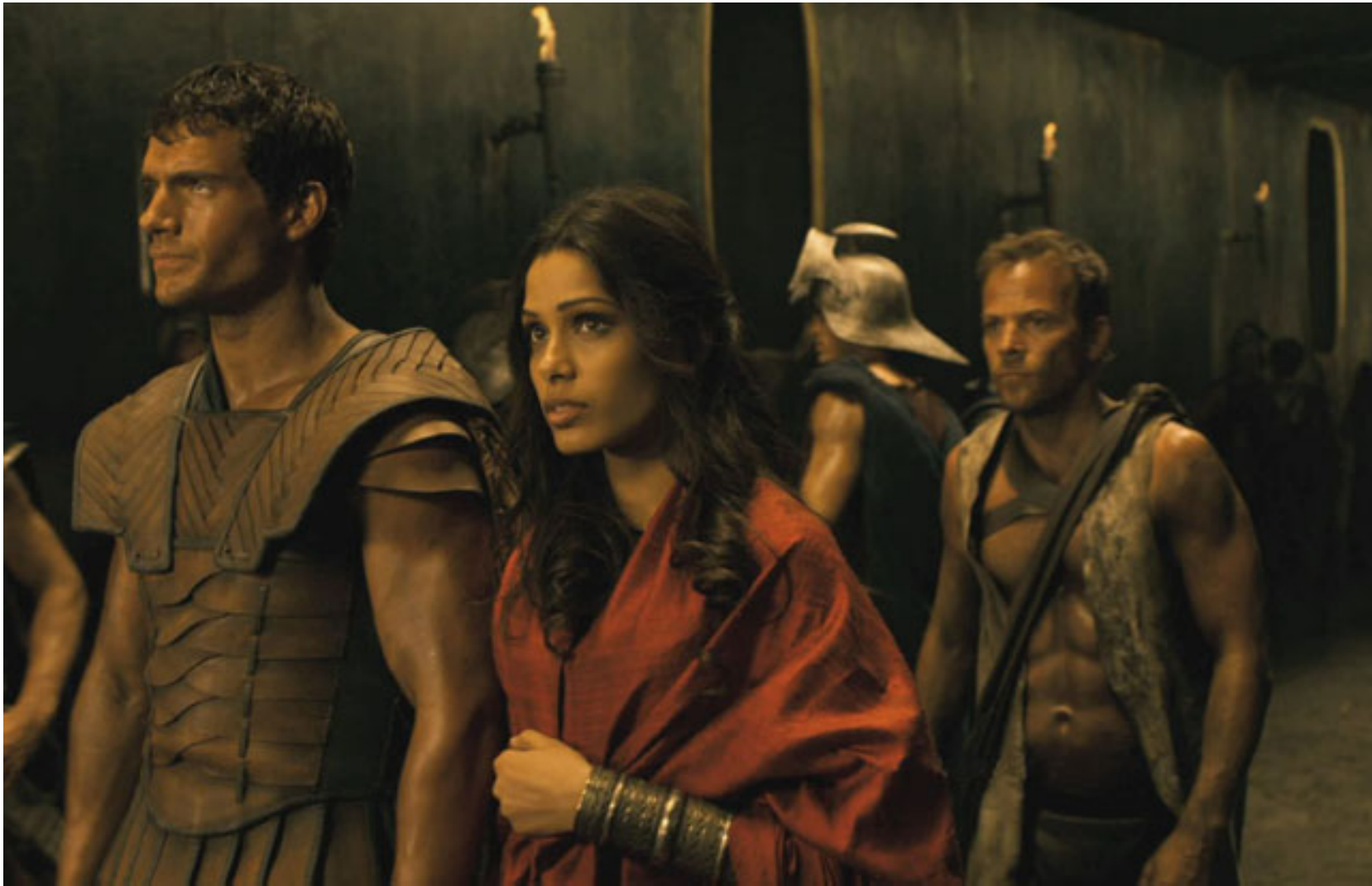
Henry Cavill as Theseus, Freida Pinto as Phaedra and Stephen Dorff as Stavos in ‘Immortals’