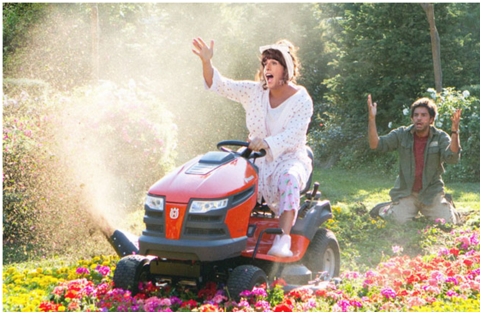
It's Funny Because She Can't Mow: Adam Sandler as Jill and Eugenio Derbez as Felipe in 'Jack and Jill'