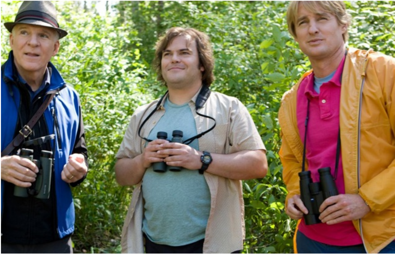
Steve Martin as Stu, Jack Black as Brad and Owen Wilson as Kenny in 'The Big Year'