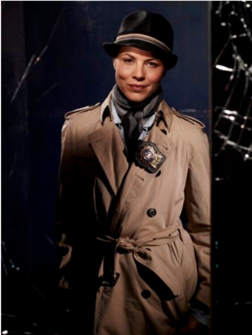
Prime Suspect