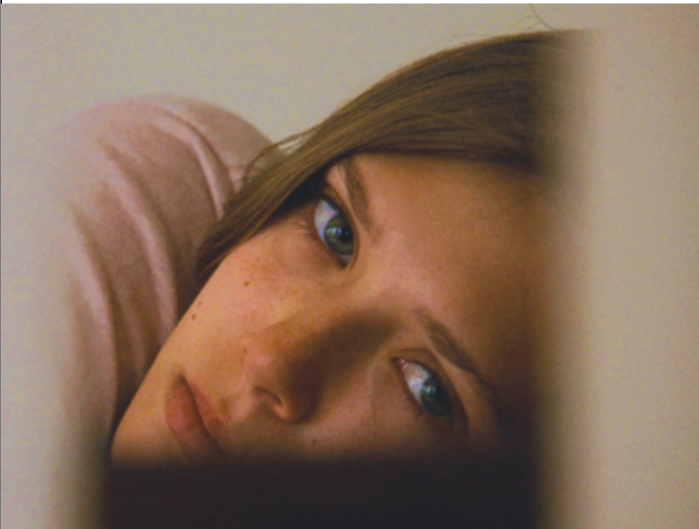
Martha Marcy May Marlene

evenly-split-into-two-chapters film that she absolutely has not. The second half consists of the rest of her family fearing that the planet Melancholia will crash into their lives as well. We will write a lot more about this film for its theatrical release and, in all likelihood, in year-end features here on the site. It's that good.