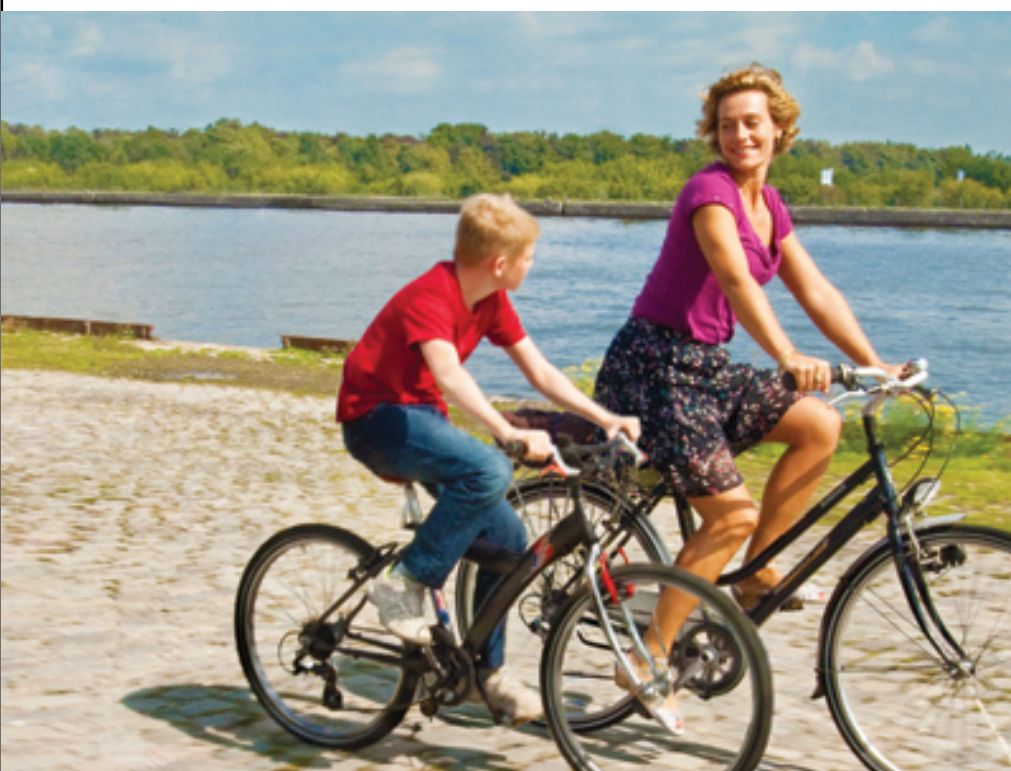
The Kid with a Bike

It would be too easy to describe Sean Durkin's highly-acclaimed debut as the “Winter's Bone of 2011.” Like that Oscar nominee, “Martha Marcy May Marlene” started its buzz at Sundance, features a striking debut female lead, and both even have the great John Hawkes delivering stellar supporting performances. But “MMMM” stands completely on its own as one of the most memorable dramas of the year. I'll admit to a bit of trepidation after first seeing it, thinking perhaps it was a bit too purposefully vague in its storytelling, but I think it's the question marks left by the film that really allow it to linger in the memory. Well, that and what is easily one of the best performances of the year in any category from the great Elizabeth Olsen (who we were lucky enough to interview...watch for it in a few weeks). This talented young lady perfectly embodies a woman who runs away from one fractured family in the form of a deadly-dangerous cult to return to another fractured family with her sister and brother-in-law. As she tries to remember what happened to her at the cult, the narrative twists and turns like a Moebius strip blending mysterious flashbacks with her confusing present until the tension reaches a peak in the final act.