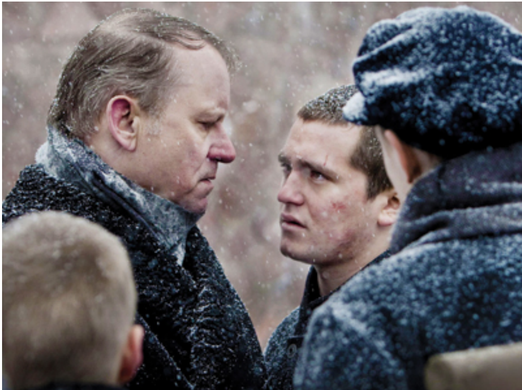
The King of Devil's Island