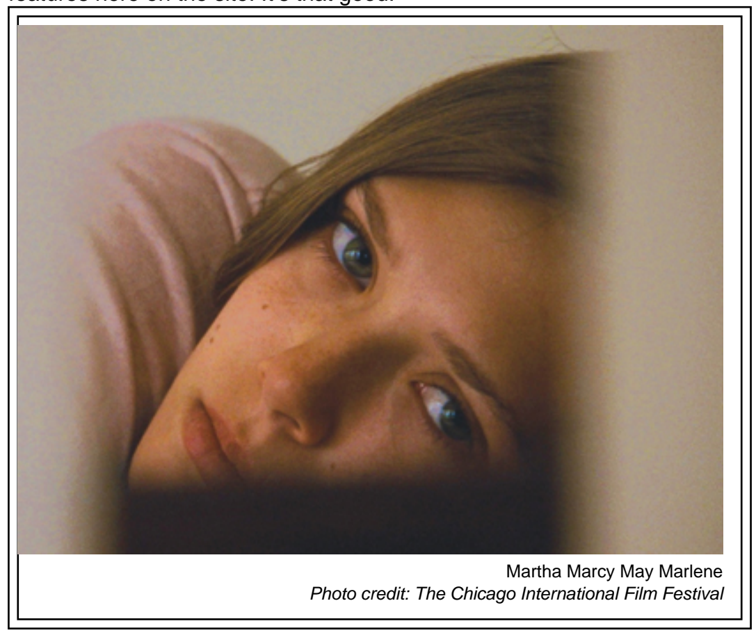
"Martha Marcy May Marlene"

evenly-split-into-two-chapters film that she absolutely has not. The second half consists of the rest of her family fearing that the planet Melancholia will crash into their lives as well. We will write a lot more about this film for its theatrical release and, in all likelihood, in year-end features here on the site. It's that good.