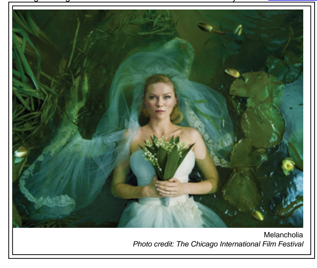
"Melancholia" October 7th, 8:30pm

The top tier of film's in the first four days of the 47th Chicago International Film Festival includes "Melancholia," "Martha Marcy May Marlene," "The Kid with a Bike," "Rabies," "Like Crazy," "Miss Bala," "On the Bridge," and "The King of Devil's Island." In order of quality, although all eight of these films are worth a look. Go buy tickets at the official site [15].