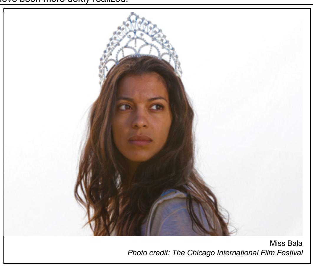
"Miss Bala" October 8th, 8pm October 10th, 8:35pm

I've seen a number of brutal films in my many years of covering the Chicago International Film Festival but "Miss Bala" will be one of the first to spring to mind if anyone asks me about the darkest films I've seen in the Windy City. The word "brutal" doesn't even do this dark, violent, horrific drama justice. It's a film that becomes almost numbing in its tone (and I think that's a bit of a problem but will get into that more in a full-length review) but it's incredibly well-made and performed. The story of a young lady caught in a VERY bad situation in the middle of the drug war that has ravaged the border between Mexico and California may seem familiar (we've seen films like this before at CIFF) but "Miss Bala" carves its own harrowing personality by sheer force. Viewers should be warned that this is an incredibly bloody, violent story about a woman who is essentially kidnapped and turned into a criminal by a disgusting drug lord. It's a rewarding journey with some of the most technically-accomplished filmmaking at the fest but it's a journey into a part of the world that has essentially become a living Hell.