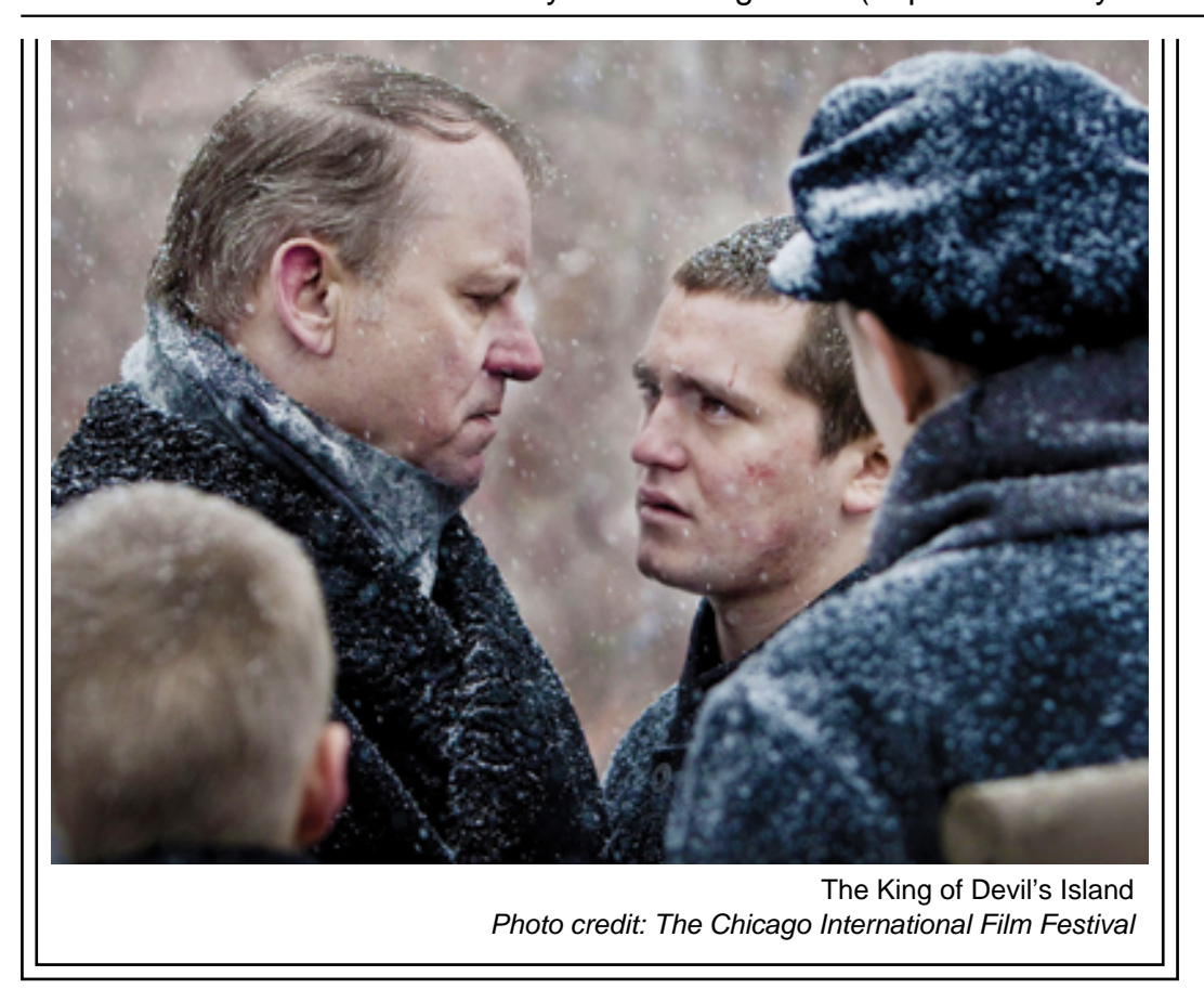
"The King of Devil's Island"