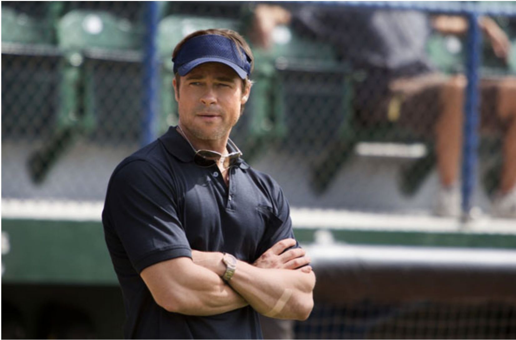
In the Field: Brad Pitt as Billy Beane in ‘Moneyball’