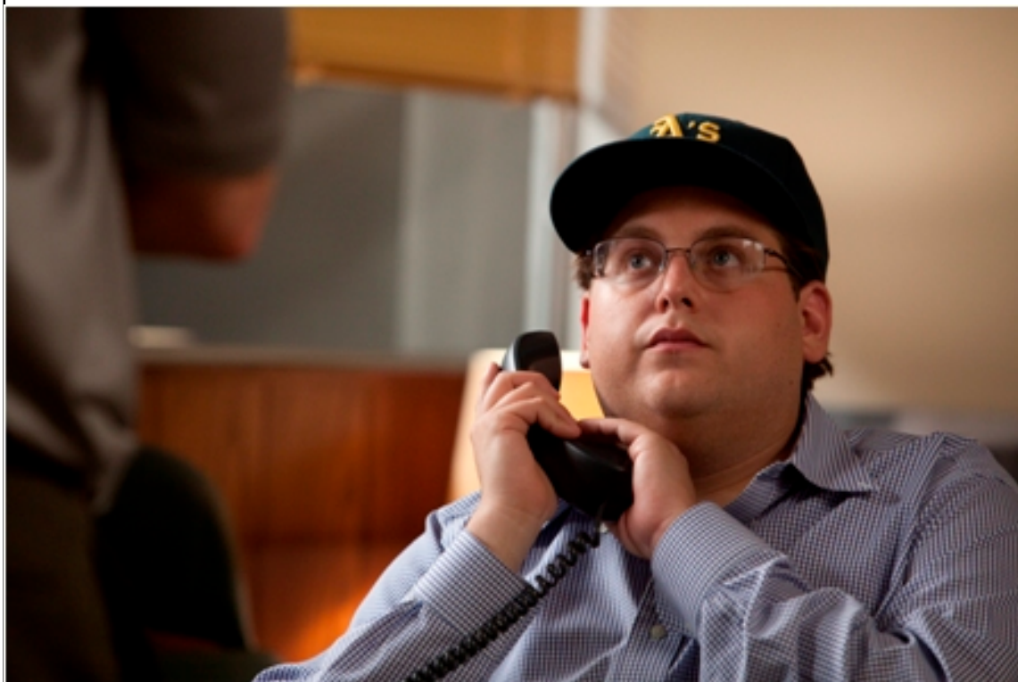
Moneyball

HILL: It's really emotional and special. The Toronto premiere was, hands-down, the most dream-like moment of my life. I was there with Bennett and Brad and myself and we got a standing ovation from 2,500 people and I broke down like a baby. My parents and friends were there. I took one look at my friends and was uncontrollably crying. It's just crazy. The whole thing.