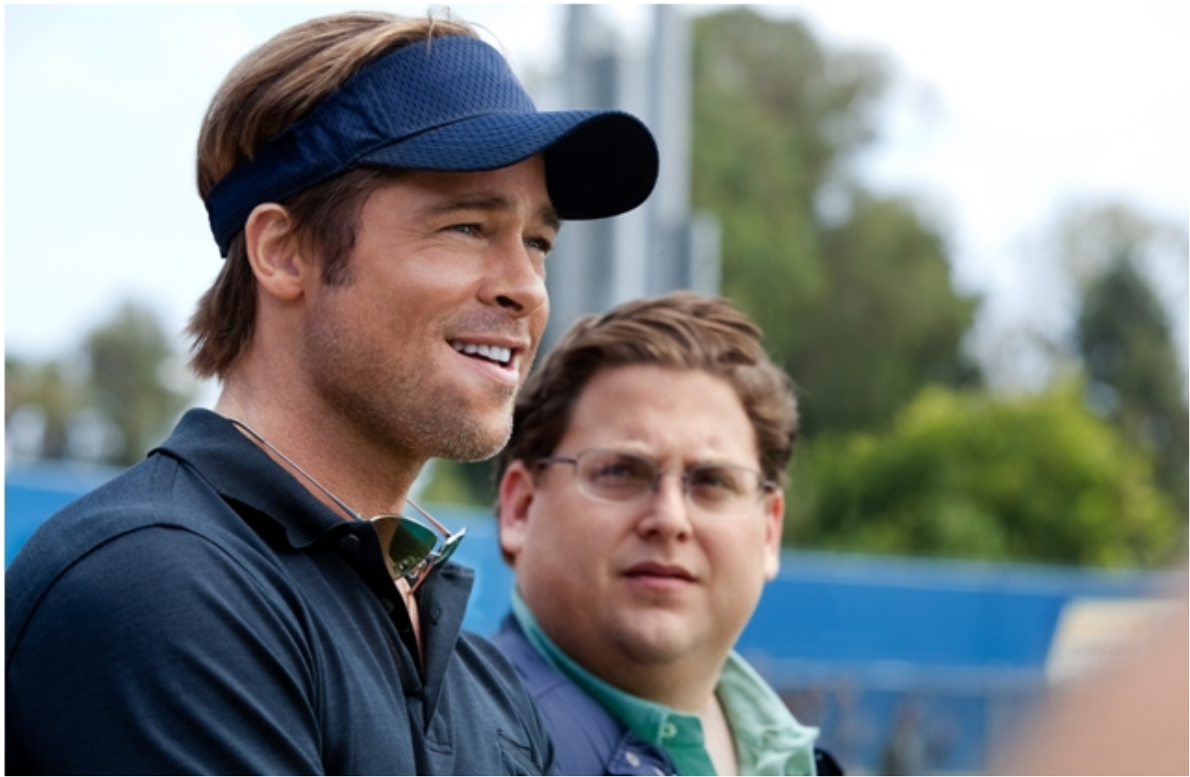
Moneyball

HollywoodChicago.com: I love how he lets the whole thing breathe. A lot of directors would have made a 90-minute version of this film but he lets it take time.