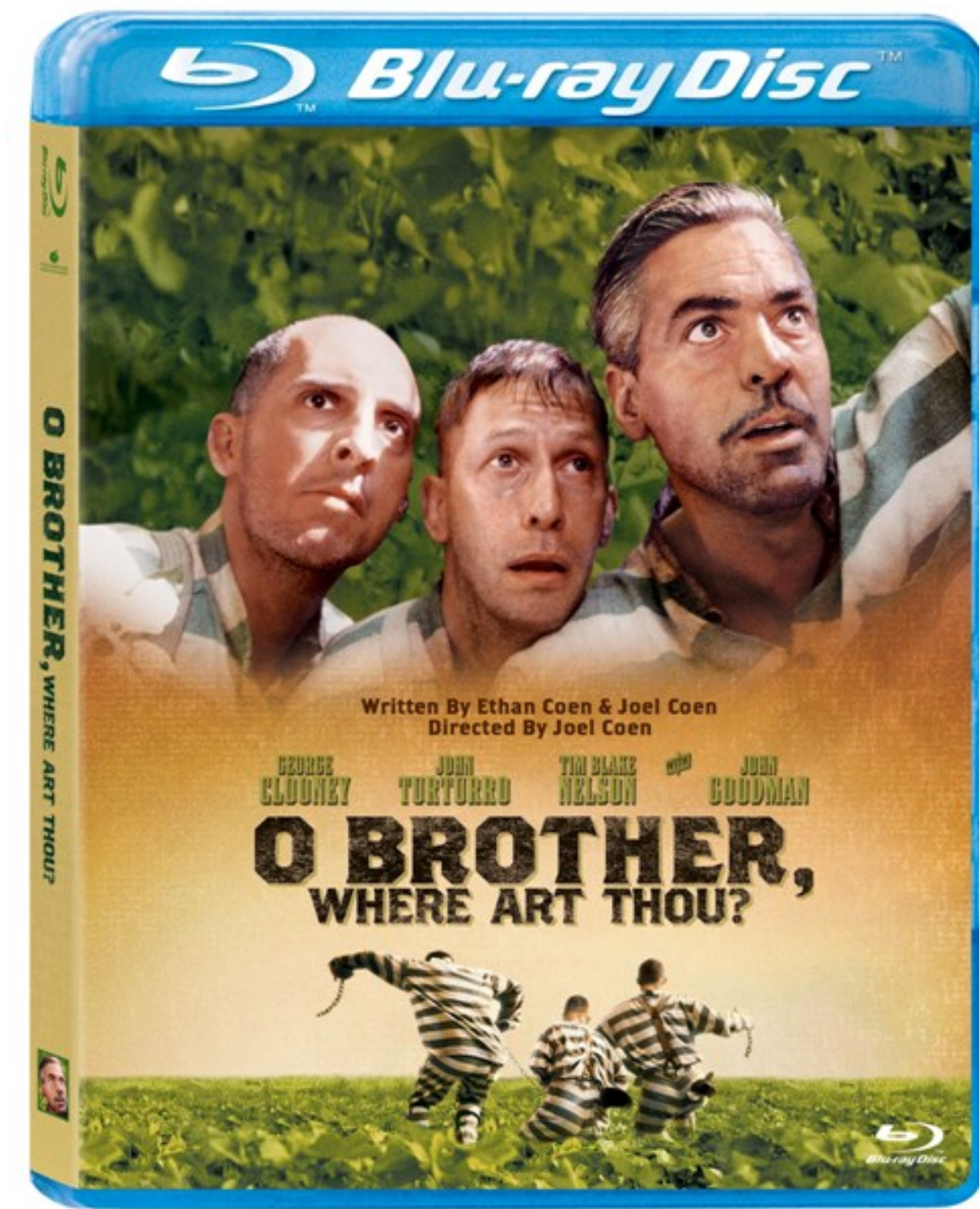
O Brother, Where Art Thou was released on Blu-ray on September 13th, 2011

Synopsis: George Clooney (The Perfect Storm) and John Turturro (Cars 2) embark on the adventure of a lifetime in this hilarious, offbeat road picture. And now, for the first time, this quirky gem shines more brightly than ever in Blu-ray High Definition!