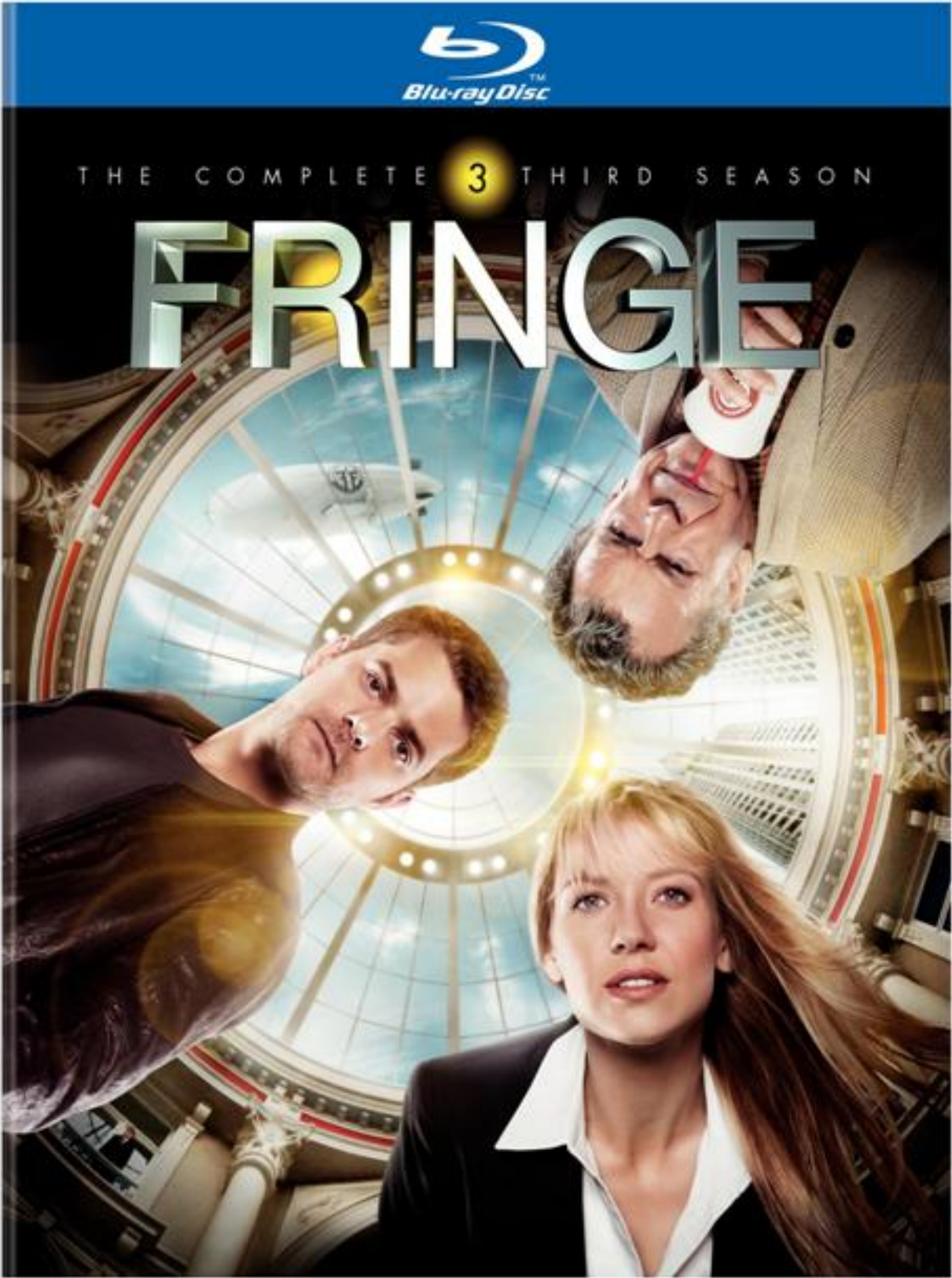
Fringe was released on Blu-ray and DVD on September 6th, 2011

Sometimes too complex. While I adore the ambition of “Fringe,” some of the episodes are a bit heavy on the exposition and a bit light on the subtlety. I wish the show was allowed to breathe every once in awhile and not always be so focused on explaining/advancing the mythology. The actors are certainly up to the challenge of deeper characterizations, especially John Noble, who was absolutely deserving of an Emmy nomination. Maybe next year.