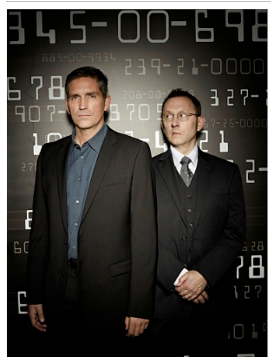
Person of Interest