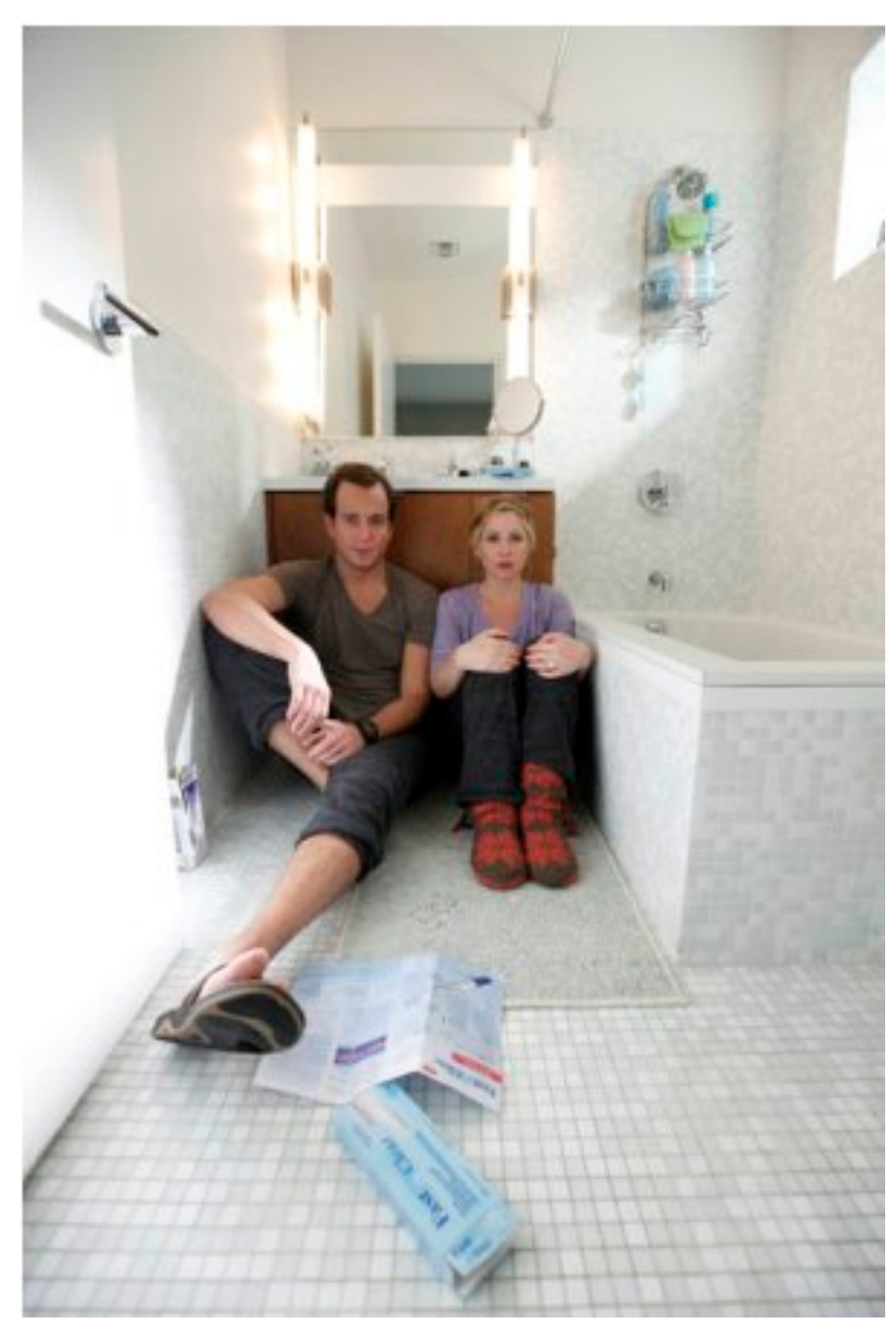
Up All Night