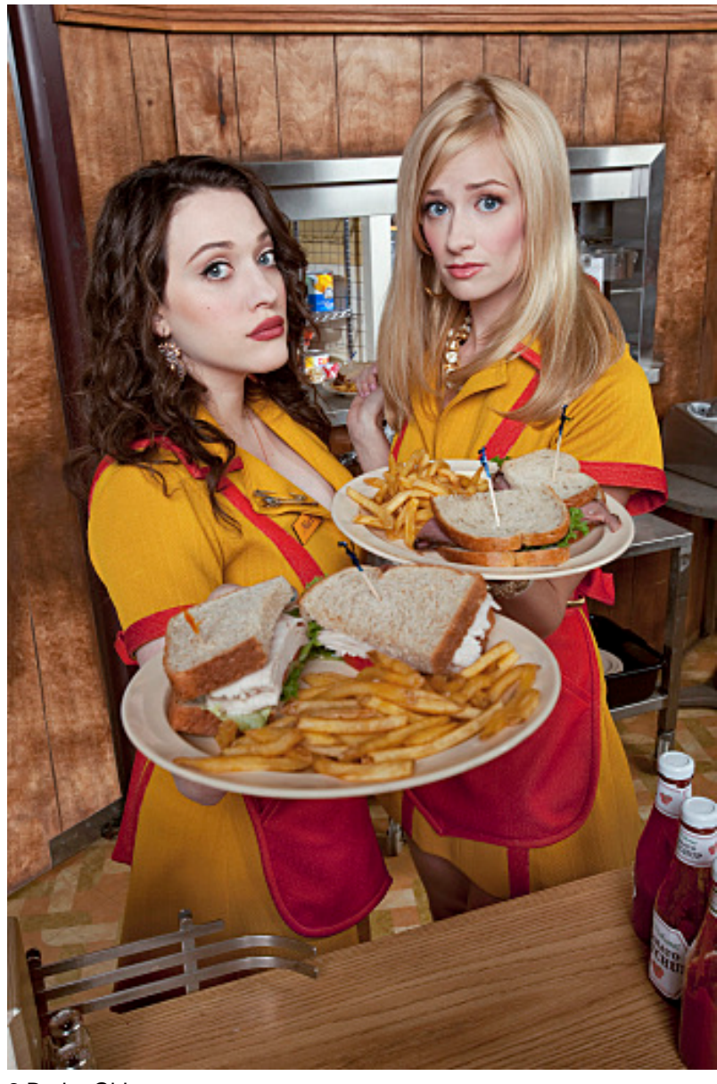
2 Broke Girls

Why You Should Set Your DVR: Because it has the potential to be the true escapist getaway of the new year. Is it weird that the mediocrity of "The Playboy Club" makes "Pan Am" better? The fact is that audiences are going to compare the shows — two mystery-driven period pieces trying to find that "Mad Men" lightning on network TV — and "Pan Am" undeniably comes out on top. With a likable cast and an intriguing premise (spy stewardesses?), this show strikes the right balance of drama and escapism, not unlike the first season of "Desperate Housewives" in the way that program knew it was soapy escapism. I hope it becomes even sillier than its sometimes self-serious premiere but what strikes me the most about this show is the tonal consistency of its pilot — it lulls you in and, before you know it, it's over and you're wondering what happens next. It is unlikely to ever top a list of best shows on TV or win awards, but it has the potential to be the kind of consistently entertaining escapism too often missing from network television.