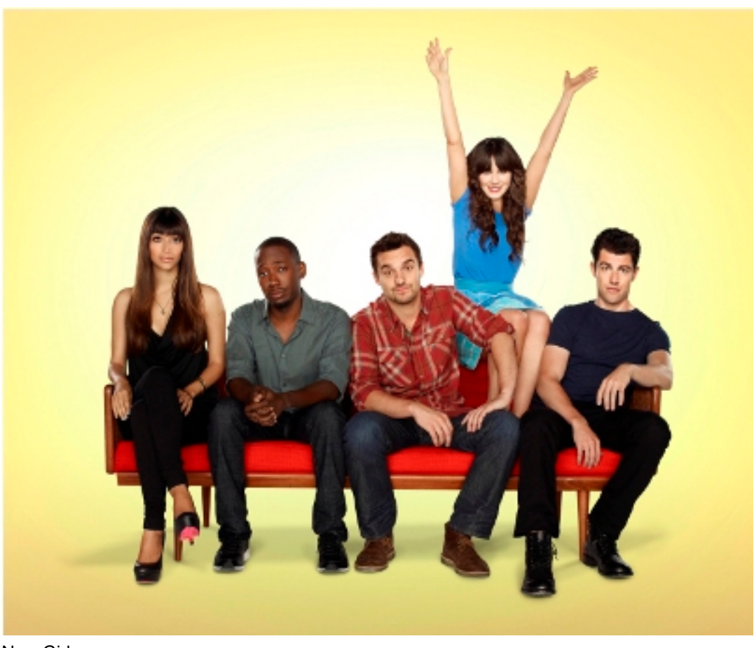
New Girl

Why You Should Set Your DVR: Because Maria Bello is instantly one of the best actresses on TV. First and foremost, stop comparing it to the Helen Mirren version. I wish this strong mystery series had taken a different name than one of the best series in the history of television because it doesn't come CLOSE to that standard. But if you ignore that and judge the show on its own terms, it's definitely got more potential than any drama this season. Bello is a spectacular actress and she's amply supported by great actors like Quinn, O'Byrne ("FlashForward"), and Acevedo ("Oz"). It's hard to tell from the premiere if this will be a mystery-of-the-week series not unlike "Law & Order" or if it will be more dramatically consistent from episode to episode. I expect a mix of the two as Bello's detective faces work problems (mostly the male chauvinism of the station) while trying catch the bad guy. There are wrinkles to be ironed here for sure but the award-worth cast added to the potential of a dark, adult-driven mystery series that doesn't focus on DNA or storytelling tricks earns it the highest dramatic spot of the new season.