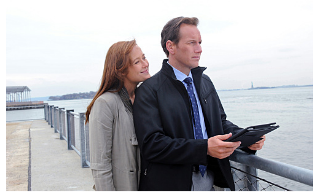
A Gifted Man

Why You Should Set Your DVR: Because it's got just the right blend of cheese and sleaze. We know, we know — Another reboot? When are they gonna learn? Didn't anyone notice that "Bionic Woman" and "Knight Rider" didn't exactly work? Hell, "Wonder Woman" didn't even make it to the air. There's a part of me that expects that "Charlie's Angels" will continue that pattern and hopefully put to rest this bizarre trend of failed reboots. And yet, here it is, on the list of most promising shows. Why? Because it's one of the very few programs this season that knows not to take itself too seriously. It's a cheesy retread and the best parts of it knows that it's silly. You would not believe the number of programs this season with essentially goofy premises — perfect memory! fairy tale characters! time travel! — that take themselves as seriously as "Boardwalk Empire." "Charlie's Angels" has some flaws (which we'll get into in our review) but when it comes to potential, it's here — an entertaining, beautiful cast in gorgeous locations with theatrical-caliber action and silly mysteries — network TV could use some more escapism.