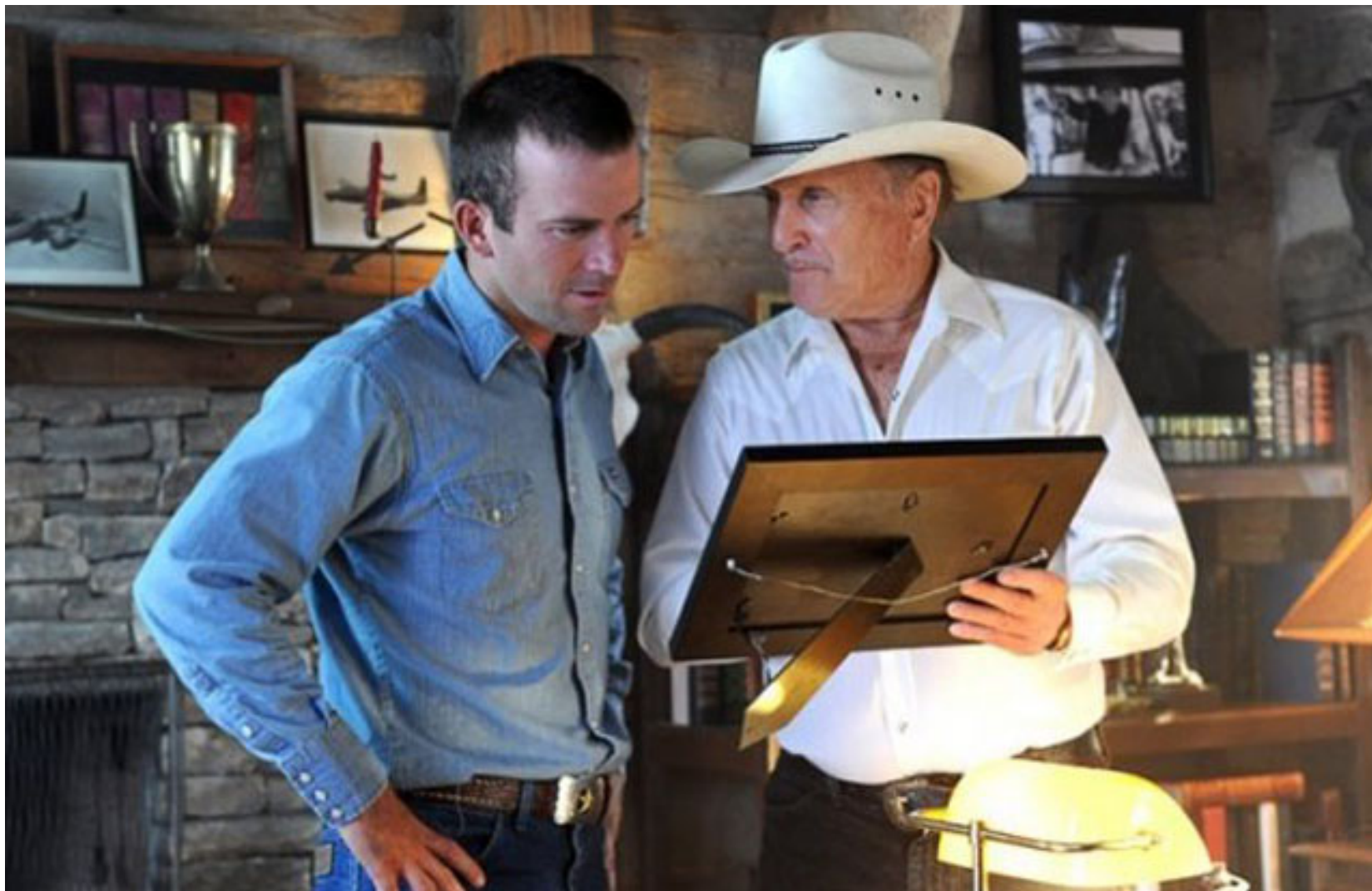
Picture This: Lucas Black as Luke and Robert Duvall as Johnny in ‘Seven Days in Utopia’