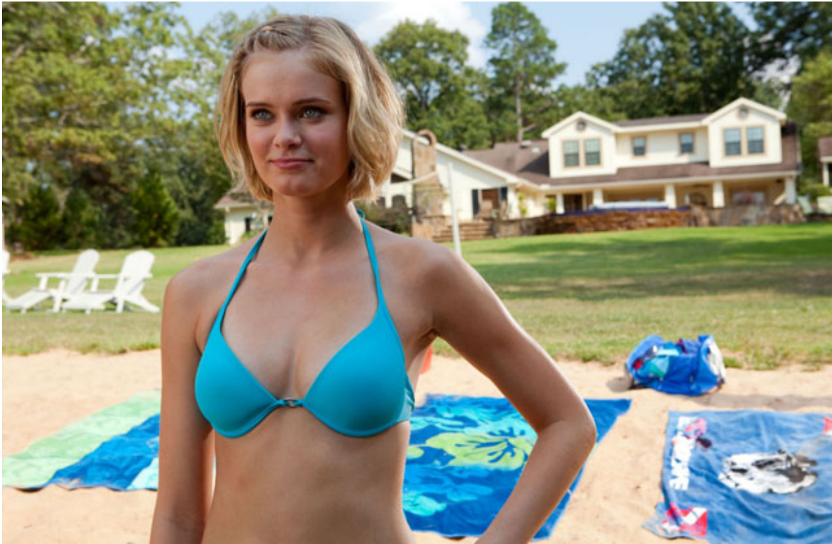
How Convenient: Sara Paxton as Sara Stands in Front of her Lake House Without a Phone in ‘Shark Night 3D’